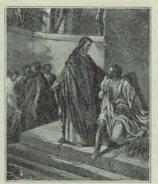
Jesus Healing an Impotent Man at the Pool of Bethesda on the Sabbath Day

himself. Let me show you. In the beginning God worked six days - worked the first weekly cycle-and rested on what we call Saturday, the seventh day, or the Sabbath. Suppose God should come here to Tennessee in human form, after this bill is passed, and He should work the first six days. which include Sunday, the first day of the week, what would you do with Him? You would put Him in