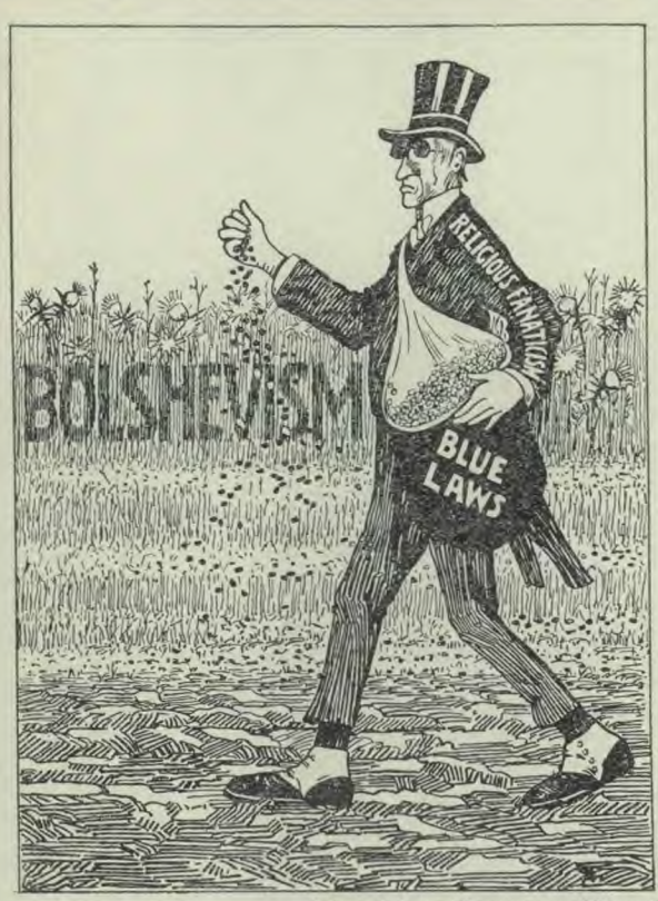
Adapted from Washington "Times"