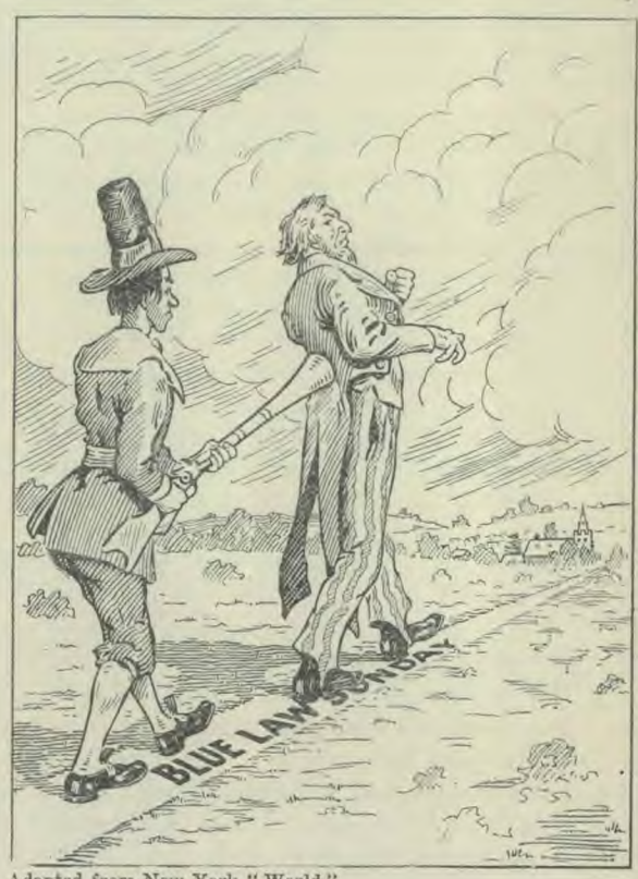
Adapted from New York "World"

Perhaps these Sunday blue law advocates think that while styling themselves "professional reformers," they do not need to be careful about their own methods of procedure, because professionalism has its own standards. A man may be a "professional" Christian and not be a real Christian. A man may do his preaching professionally, just as a lawyer or a physician does his work professionally. But a preacher who preaches professionally only, cannot reach the hearts of the people. The preacher must love his people if he would win them.