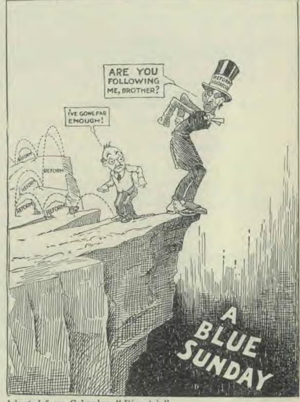
Adapted from Columbus "Dispatch"