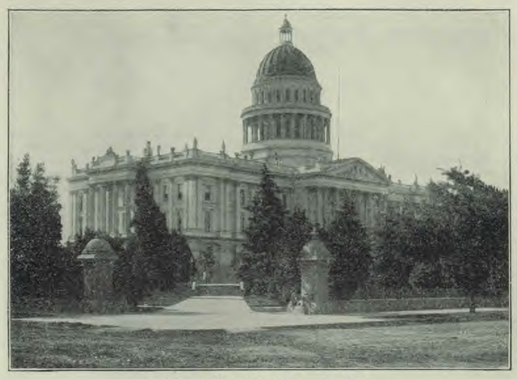
California State Capitol, Sacramento, Calif.