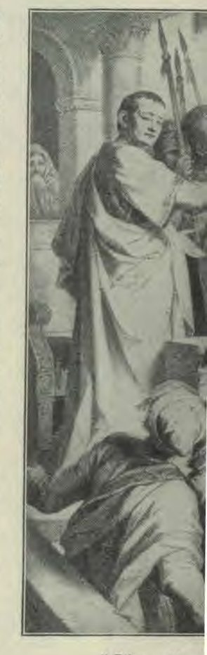
" Pilate saith un

But Pilate, representing the state, was keen to discern that it was "because