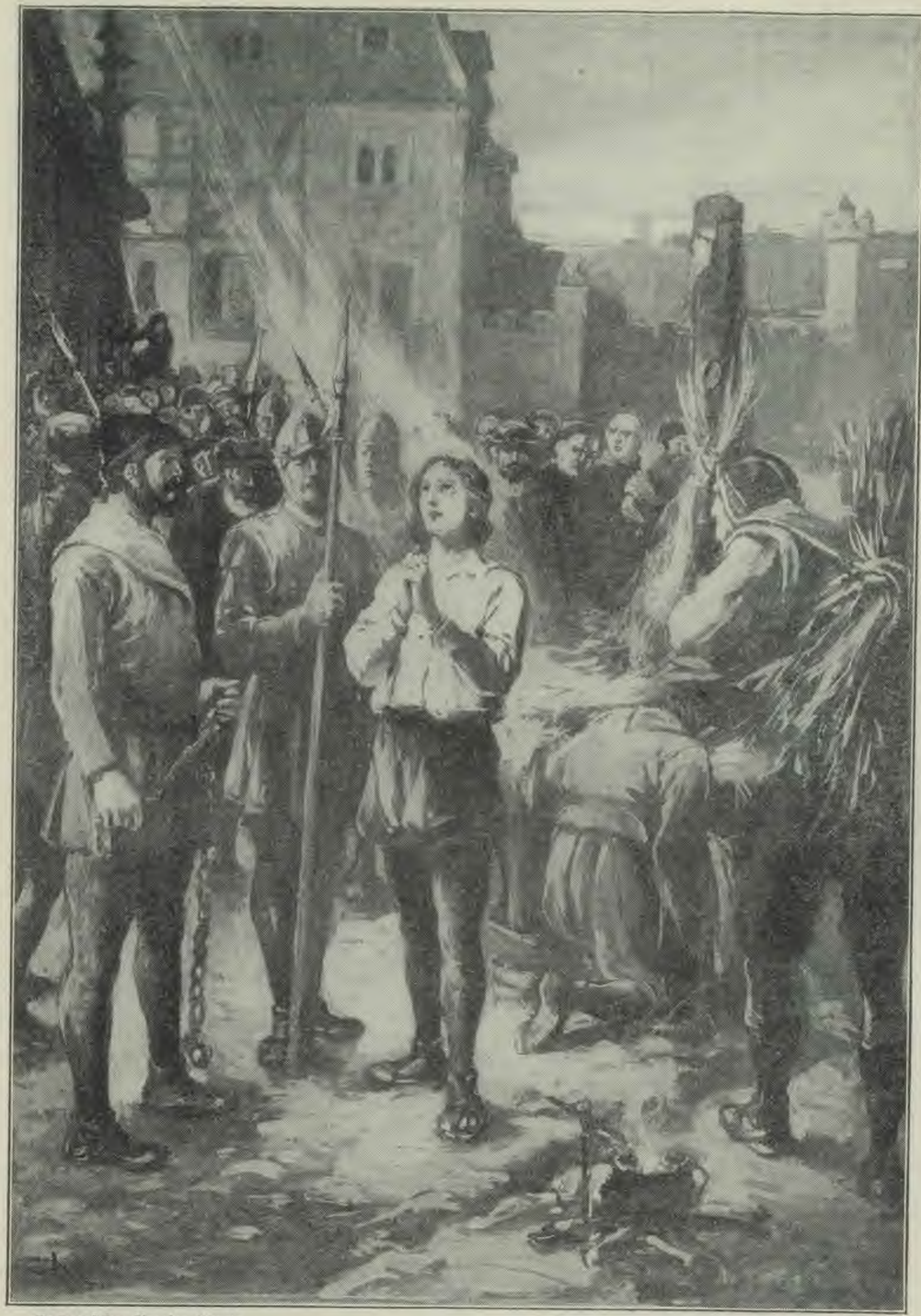
Painted by Charles Mente