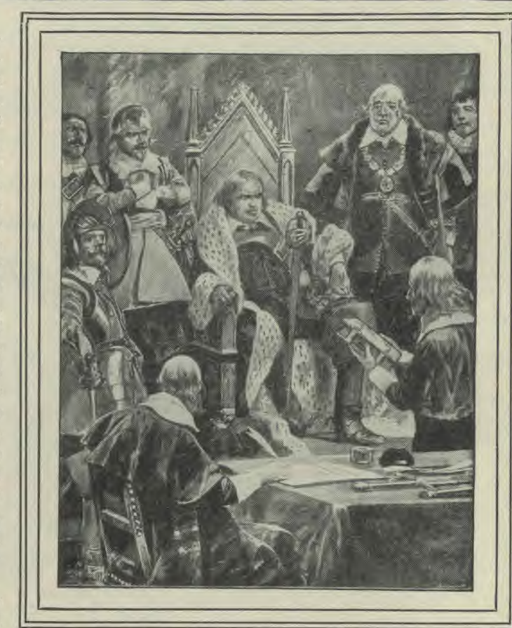
The presentation of the Bible at the Inauguration of Oliver Cromwell as Lord Protector, June 26, 1657. Drawn by R. C. Woodville.

"The entry of Charles the Second into Whitehall marked a deep and lasting change in the temper of the English people. . . . The influences which had up to this time molded our history, the theological influence of the Reformation, the monarchical influence of the new kingship, the feudal influence of the Middle