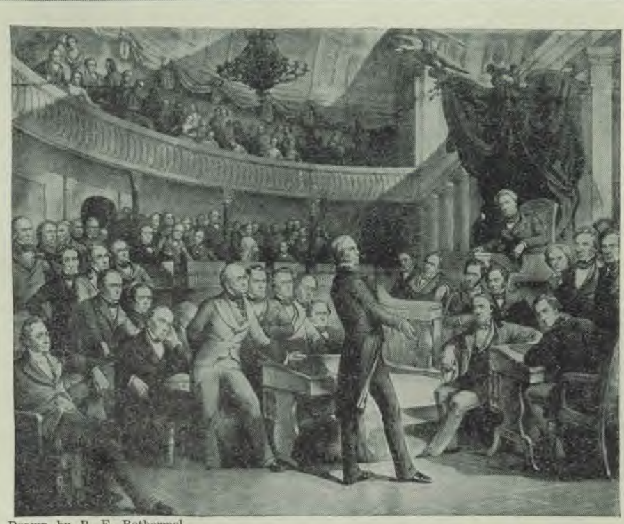
Drawn by P. F. Rothermel