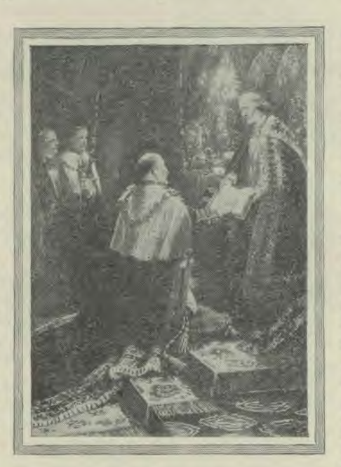
An English King Taking the Oath

"I do solemnly and sincerely, and in the presence of God, profess, testify, and declare that I am a faithful member of the Protestant Reformed Church, by law established in England, and I will, according to the true intent