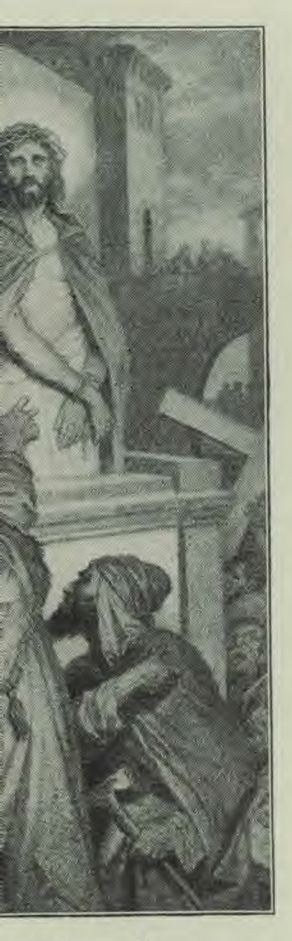
shold the man!"

Federal enactment of statutes that would result in transforming truthful, law-abiding citizens into criminals, simply because some, they say, transgress this "our law," our Sunday law; and by its legal enforcement they propose to make men righteous.