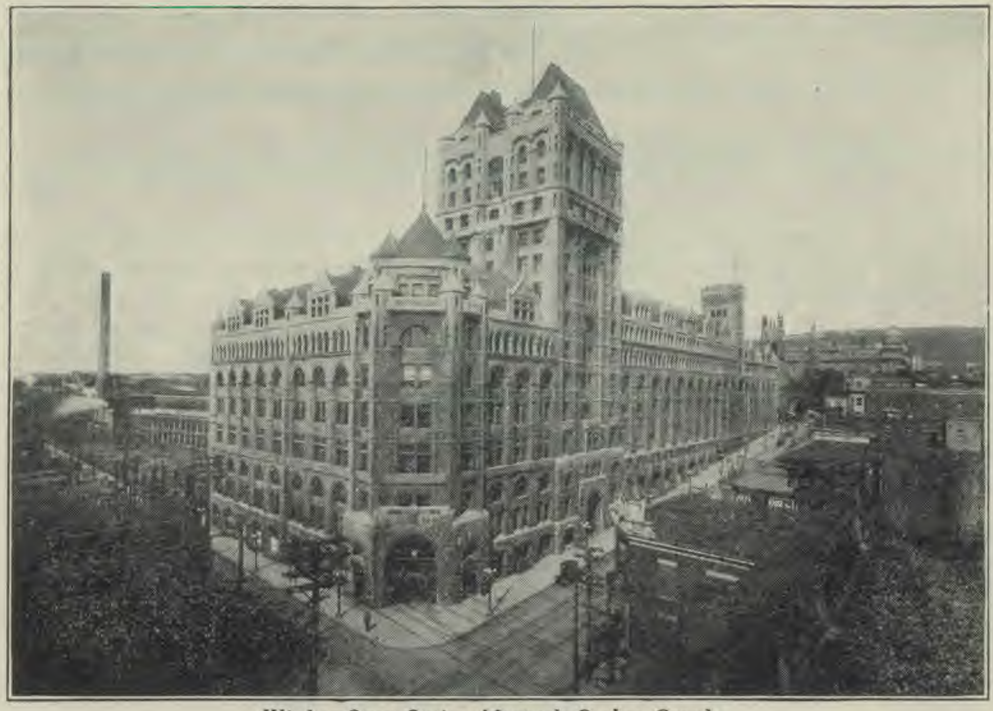
Windsor Street Station, Montreal, Quebec, Canada