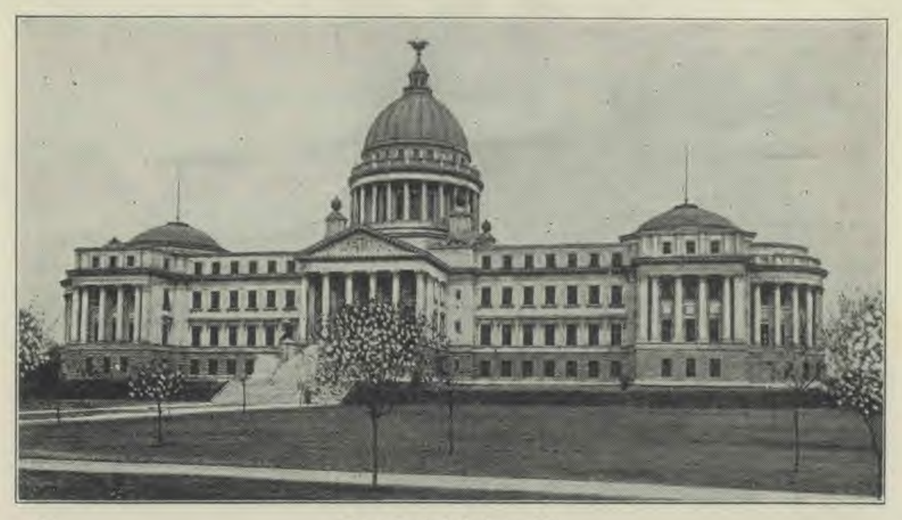
State Capitol, Jackson, Miss.

"That when so prepared and published, such course shall be used in all the public schools in this State. That it shall be the duty of the county and city