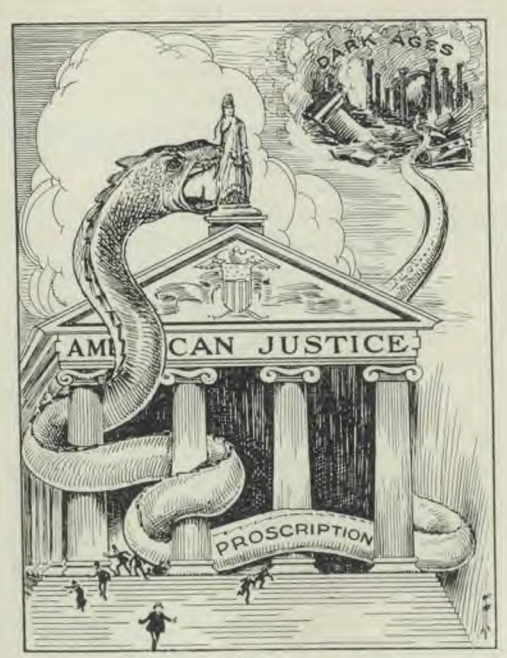
American Liberties Menaced

"Our legislators are not sufficiently apprised of the rightful limits of their power; that their true office is to declare and enforce only our natural rights and duties, and to take none of them from us."