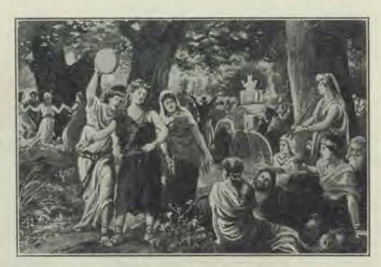
Instead of the world's growing better, as many imagine, Christ said it was to become worse and worse, until just before its destruction it would be as bad as it was in the days of Noah and Lot.

nal and sinful. selfish and covetous, proud and belligerent. and unwilling to endure insult and abuse under all circumstances in life. men will resist evil with evil and retaliate under provocation. The only wav men can be induced to suffer what Christ suffered in inno-