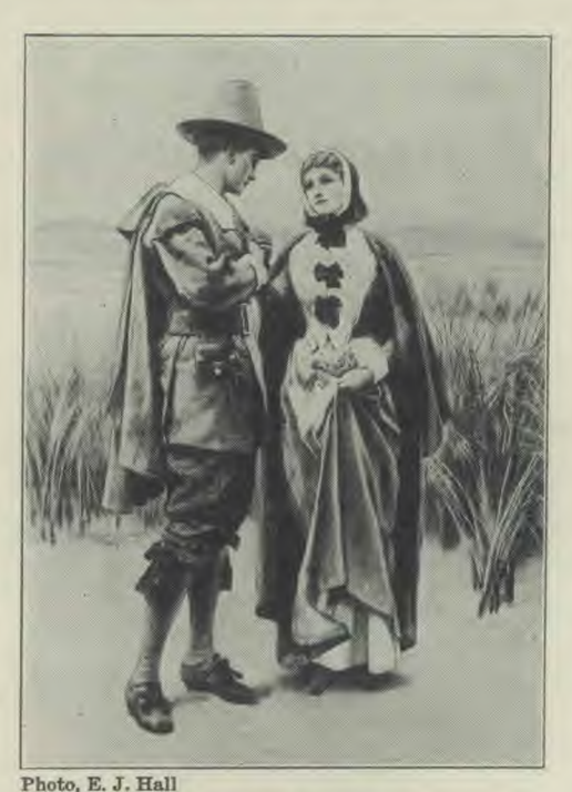
"They learned ethics and etiquette, law and government, as well as theology, by its profound study."