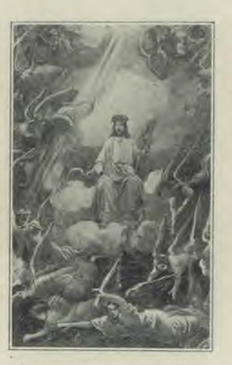
The second coming of Jesus Christ is the only remedy for all our ills.

til the very day that the Son of God is revealed from heaven. When men set up their own opinions in opposition to the Son of God and profess to be wiser than He, they are at liberty to follow their own conceit; but the man who desires to follow a better and wiser guide than his own limited wisdom, will prefer to take the counsel of the Omnipotent One. The Bible says that this world is approaching a final cataclysm and a divine recreation.