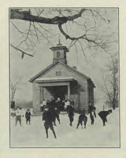
By the Editor

Many church societies provided both religious and secular education for the children of their peculiar faiths, so that they might not lose the benefits of a spir-