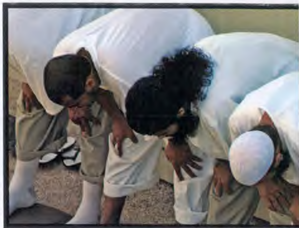
Detainees pray, Jan. 24, 2008, at Guantanamo’s Camp Four.

Some Americans were ultimately prosecuted for the Bagram torture, although the majority of the estimated 27 people involved were never charged, including the commander. While low-level perpetrators of torture are often prosecuted when the abuse is discovered, most aren’t, nor are higher officers usually prosecuted. Prosecution of civilian intelligence officers is practically unknown. Nor are torturers in the CIA’s secret prisons held accountable; nor are those government officials who arrange for “extraordinary rendition,” a process by which Muslims are sent to third-party countries to be tortured. (Those who assume that such detainees are invariably terrorists should consider the case of Maher Arar, a Canadian who was completely innocent, yet sent to Syria and tortured for ten months.) The real problem is Why are Americans torturing at all, and what gives perpetrators the idea