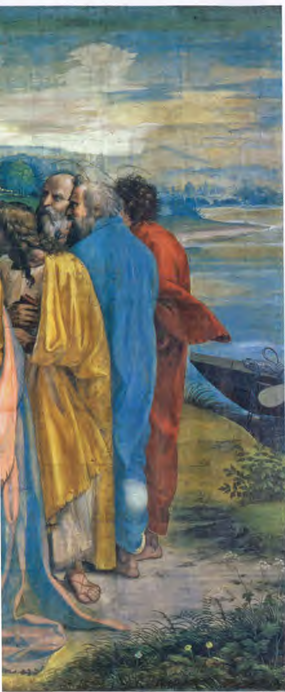
PAINTING BY RAPHAEL FROM VICTORIA & ALBERT MUSEUM, LONDON/ART RESOURCE, NY

IT IS NOT AN ACCIDENT THAT THE FIRST AMENDMENT PROTECTS BOTH FREEDOM OF RELIGION AND FREEDOM OF SPEECH. ONE IS IMPOSSIBLE WITHOUT THE OTHER.