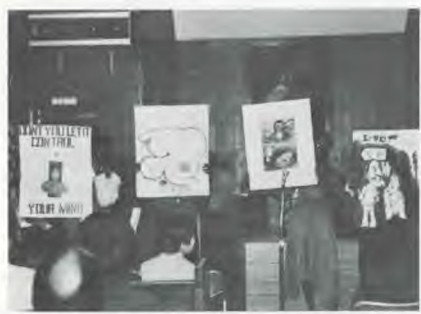
Poster participants at the Central AY program.

Each local church is to organize into Adventist Youth for Better Living groups. Membership is directed primarily at ages 14-35. The groups, once organized, are to use guidelines set up by the World Temperance Department for academy and college participation.