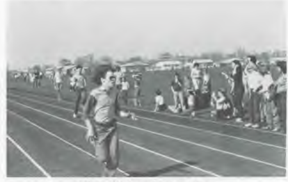
The 880 relay race.

The afternoon was filled with various events: running, jumping ropes, tying knots, and finding the various directions of the compass. The scoring was set up in such a way that should the club successfully complete the event, full points would be given. This way, competition between clubs was minimized. Enthusiasm ran high throughout the day.