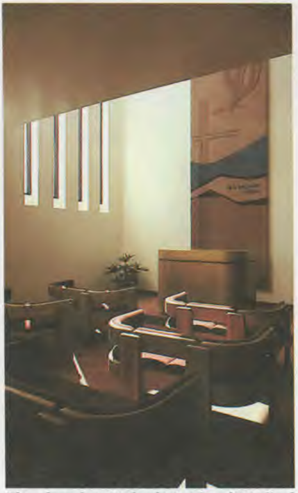
The chapel at Moberly Regional Medical Center, Moberly, Mo., provides a central focus for patients and visitors. The center was completed and dedicated this spring.

Recognizing these needs for strengthening, the Seventh-day Adventist Church has established the Adventist Health System, which is operated in geographical systems for managing its health care facilities.