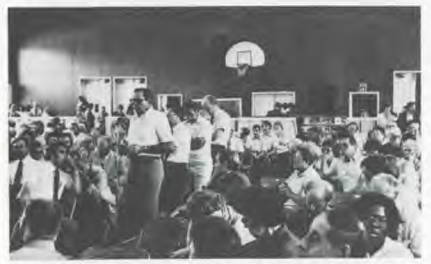
Constituents line up to discuss the sale of the Kansas City Conference Office

Delegates to a special constituency session held August 16 at Sunnydale Academy, voted by a 2-1 margin to accept an offer by a Kansas City firm, Professional Services, Inc., to purchase the former Missouri Conference office building.