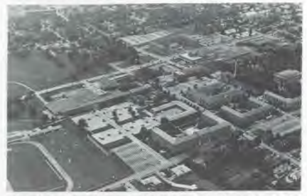
Northeast Missouri State University, site of the 1982 Iowa-Missouri campmeeting, June 1-5.

the conference, many individuals expressed a desire to have one general campmeeting for the entire conference. Acting on these suggestions, the