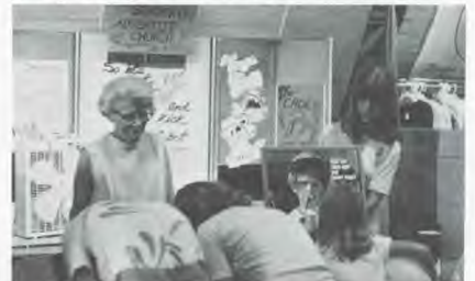
Visitors registering for the free gift at the fair in Atlantic.

The Atlantic Seventh-day Adventist Church operated a temperance booth during the 4H fair August 3-6 at Atlantic, Iowa. A free subscription to LISTEN magazine was given away, and 437 people registered for the free gift. Two