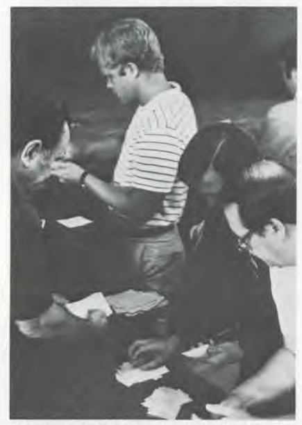
Session delegates participate in the counting of the ballots at the close of the special constituency session.

Following presentations giving background information regarding the recent sale of Sunnydale Academy's SS Plastics industry and the history of the development of the offer to purchase the Kansas City office, discussion on the proposal began and continued for more than three hours.