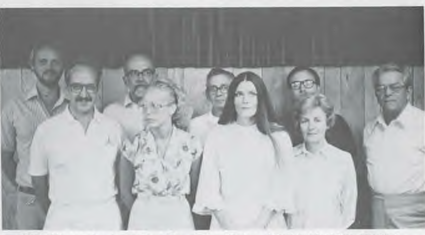
Part of those who stopped smoking during Piedmont Park's latest five day plan.

Wessels contributes this long-range success to the follow-up plan he uses after the five days are over. The Monday night after the last program a "rap session" is called, giving the participants opportunity to compare notes