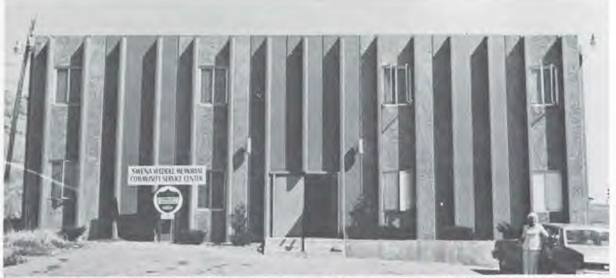
The new center is housed in the upper floor of the gymnasium building on the church grounds.

The new center has been named the "SWENA, WEDDLE MEMORIAL COMMUNITY SERVICE CENTER."