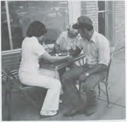
Visitors at the blood pressure clinic at Rockwell City

A blood pressure screening clinic conducted in Rockwell City, Iowa, on August 24 attracted considerable interest from the business community of the city and high praise from the local Civil Defense Director.