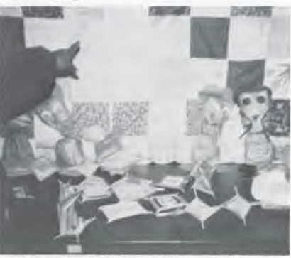
Crafts made by the children at Vacation Bible School.

Some of the crafts, such as lap quilts, were given to a nearby nursing home, Stovall Care Center. The children were excited about their creations and readily displayed them to visitors, friends, and family.