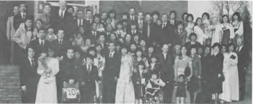
The church family of the Denver Korean Church. Many of the ladies are wearing beautiful dresses which would be worn for such an occasion in their homeland.

During the last two and one-half years, 16 persons have been baptized and two persons joined the church by profession of faith. In addition to 58 baptized members, there are 15 Sabbath School members who are studying and looking forward to church membership.