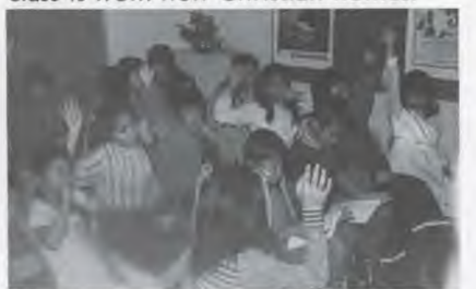
Primary Sabbath School members of the Minneapolis First Church.

What is so unusual about the primary Sabbath School at the Minneapolis First Seventh-day Adventist Church? Besides being international in nature, about 50 percent of the class is from non-Christian homes.