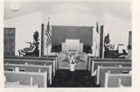
Interior of the new sanctuary at Newton