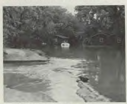
High water at Camp Arrowhead

Broken Arrow Ranch, near Olsburg, Kansas, had a downpour which caused water to flood the basement of the