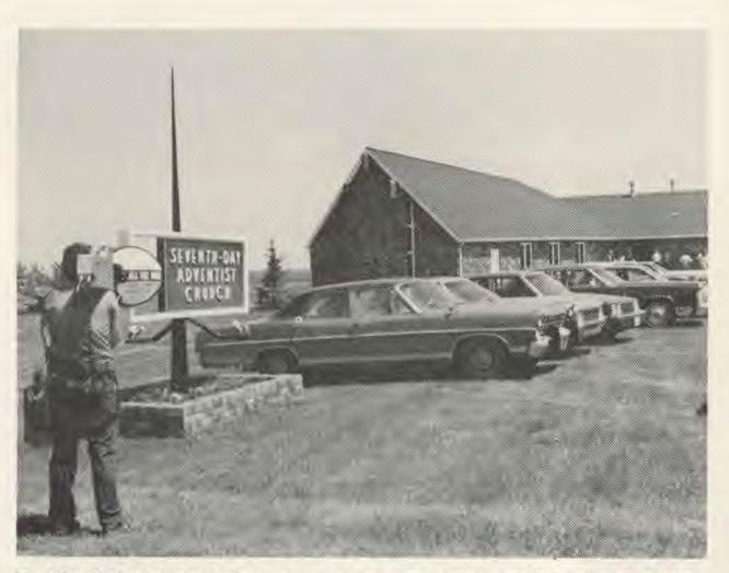
Unidentified television cameraman records proceedings at the church.