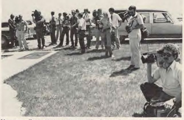
News media camera crews wait for funeral services to conclude.