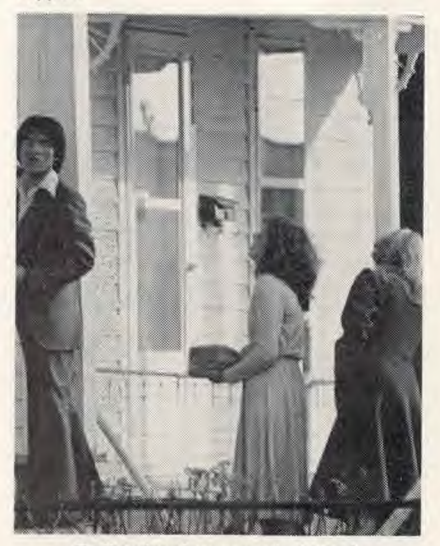
Delivering homemade bread.

The United Way Volunteer Action Center (VAC) put them in touch with such organizations as the Easter Seal Foundation, YMCA, Parents Anonymous and others. They played wheelchair basketball with the handicapped; they babysat so parents could attend Parents Anonymous classes; they assisted with swimming lessons for the mentally retarded and handicapped; and they visited nursing homes. They baked bread in the cafeteria and distributed it in the community. They also gave assistance to Pride, Inc., an organization designed to mainstream the handicapped.