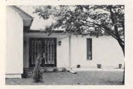
Exterior of the Newton Church

The congregation's attitude for the future seems to be, "Come and watch us grow." A packed sanctuary filled with friends and neighbors from far and near, as well as local business people, joined them in dedicating this beautiful facility to the purpose of preaching the gospel to the unsaved in their portion of God's vineyard.