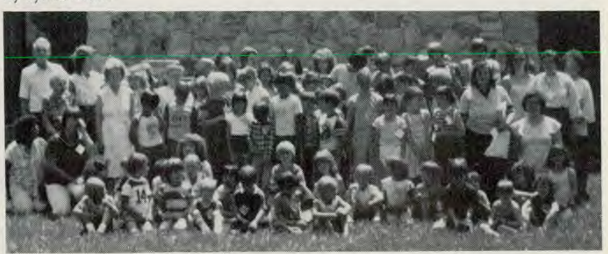
The Enterprise Church held a VBS June 20-24 with an attendance of 81 children.