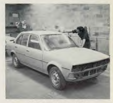
Final touches applied.