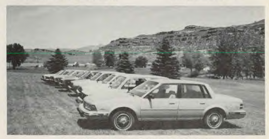
Some of the cars that have been sold at a discount.