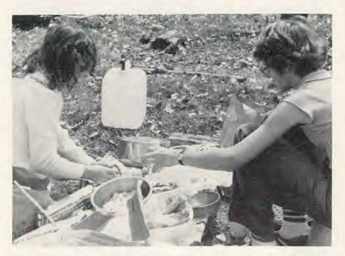
A meal prepared in the "out-of-doors" by students at the Wray, Colorado church school is an annual event eagerly anticipated.