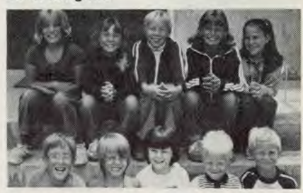
Some of the children attending Hemingford VBS