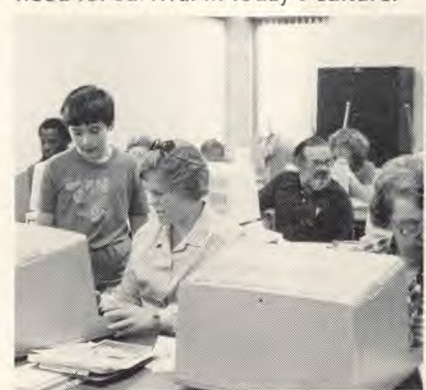
Mid-America teachers participate in computer literacy classes at Union College.

By educating educators in how to handle computers and overcome their fears of them, the Seventh-day Adventist Church and Union College will. according to Simmons, be better able to teach young people the skills they need for survival in today's culture.