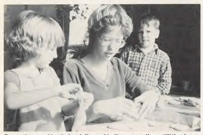
Preparing cookies to be delivered to those needing a "little cheering up" on Valentine's Day as a Share Your Faith project at the Wray, Colorado church school.

The church family has been involved in the educational process throughout the year by giving both personal and financial support in school activities. The Home and School organization sponsored a garage and bake sale under the