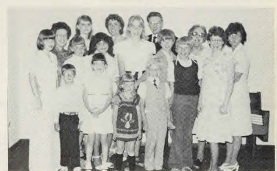
COLUMBUS, NEBRASKA—The Columbus Church held their second Vacation Bible School in June, with 21 children attending. Pictured are some of the children with the teachers and leaders.