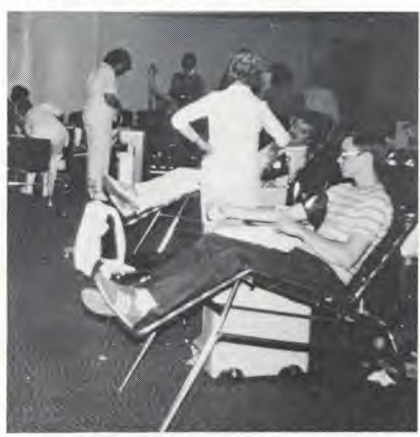
Students participate in blood drive.

The Community Blood Bank and the Division of Nursing joined forces again this fall during the Lincoln Community Blood Drive. Students and staff gave 118 pints of blood. The college benefits from the program also. If any student or staff member should need blood in the next year, the person would receive it free since the college exceeded the 100-pint goal.