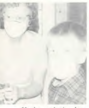
Masks protect volunteers as they work with the insulation.