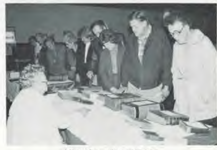
Viewing the Bibles

sented at the program was a children's choir from various churches in Platte. The offering that was received was given to the Platte Nursing Home to apply toward a sound system for the facility.