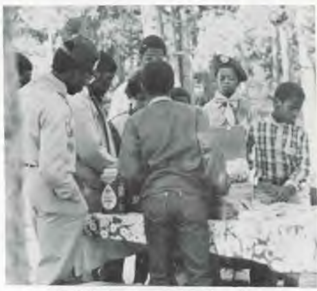
Pathfinders preparing lunch.

nature walks, mountain climbing and hiking. The Pathfinders of the Denver Park Hill Church displayed their talents and proficiency in all areas of camping.