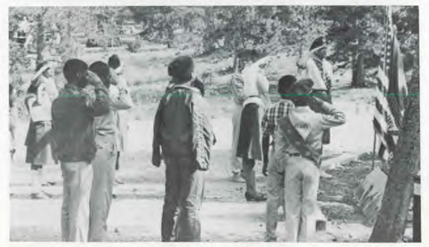
Flag raising at camp.

Sabbath morning services were conducted by the youth, with Elder Miller speaking at the divine hour. The camp-out featured tent inspection,