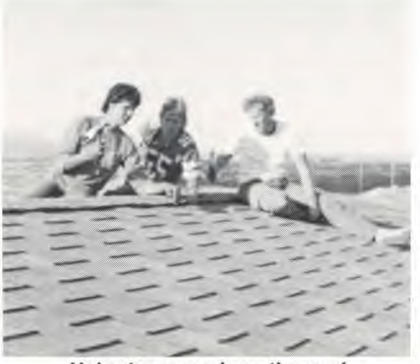
Volunteers work on the roof.

On the official opening day, the secretary of the local Ministerial Association spoke briefly on the parable of the mustard seed, and then cut the ribbon, opening the church. Presbyterian minister