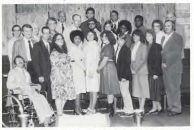
One of the large groups baptized as the result of the evangelistic campaign.

The congregation provided nightly encouragement through faithful attendance and bringing visitors and friends. The Lord richly blessed all the efforts and twenty-one precious souls were received into baptism. Several others are continuing to study. Pray that these new members may remain faithful.