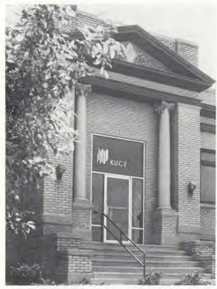
KUCV-FM, the college radio station, increased its membership to 1400 this year. Memberships are awarded to listeners who support the station at various dollar levels ranging from $30 to $500.

In 1980, KUCV 91 FM, increased it's power from 10 watts to 18,200 watts. Along with a power increase, KUCV has experienced growth in