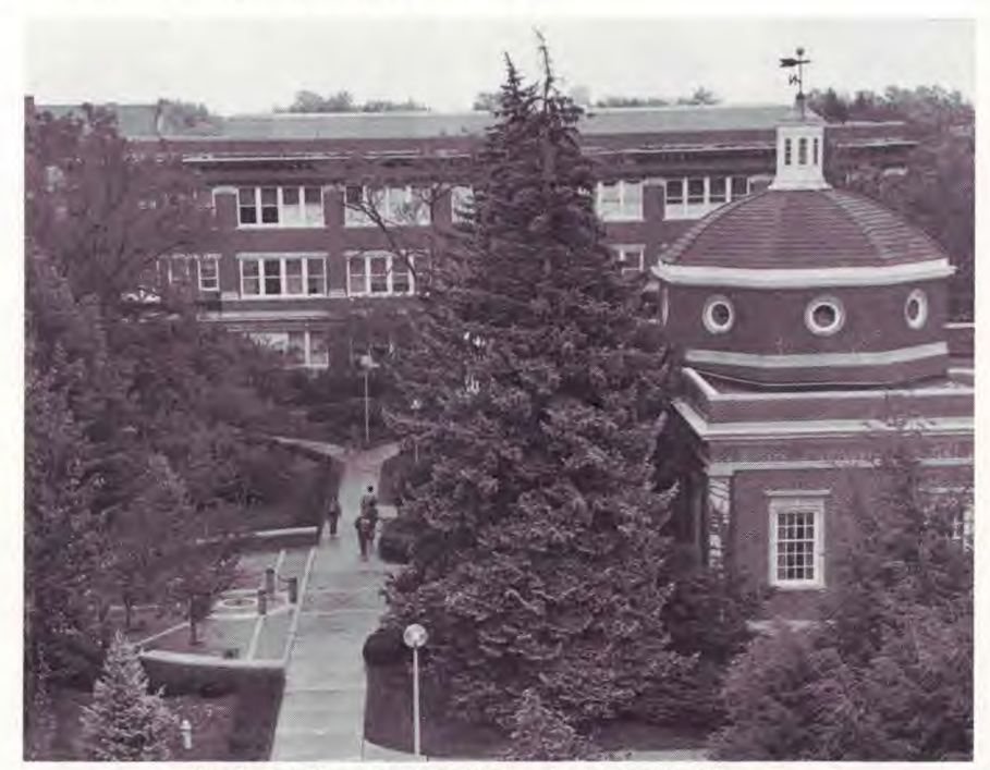
Northeast Missouri State University, Kirksville, Missouri.

Daytime activities at camp meeting revolve around a series of special workshops in Biblical studies and practical living instruction. The early morning devotionals, Wednesday through Sabbath, will be devoted to a series of studies on