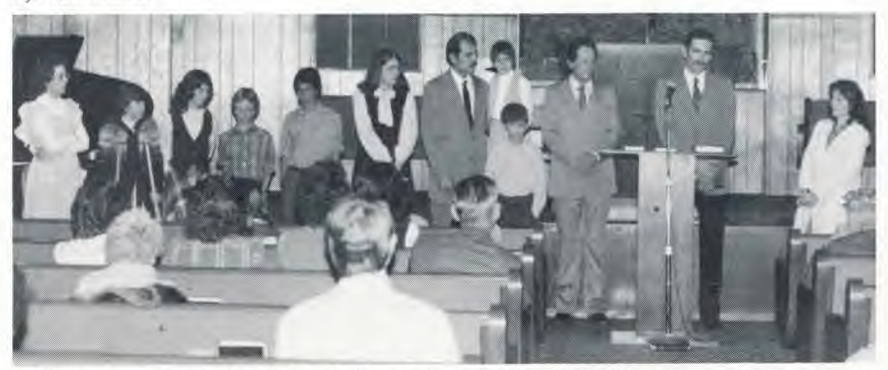
Dedication service in the Eden Valley, Colorado church for the eleven missionaries to

"Missionary, missionary, goodbye!" The cradle roll children sang the familiar words. Their hands waved goodbye to the missionary, but this time she wouldn't return the next Sabbath to join in the song. She would be in Taiwan.