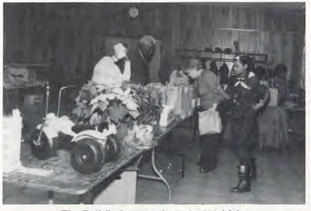
The Pathfinders conducted a food fair.