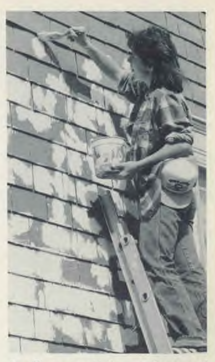
For five years Union students and faculty have been volunteering to paint worn and weather-beaten homes in Lincoln.

can make up a significant portion of the typical student's life at Union College.