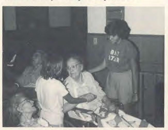
Campers visited nursing home residents.

Have you ever wanted someone to pull up weeds, wash cars, or pick up trash in your community for free? Spencer, lowa was blessed to have a group of young people from Weimar Institute that organized the youth in the community to do just that.