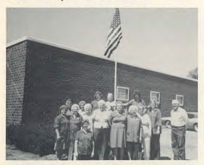
The VFW officers, from Buffalo, Iowa presented the Muscatine Community Service Center with a beautiful silk flag.