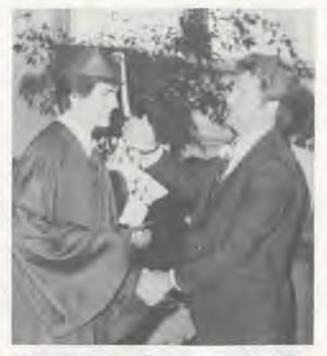
We reach a milestone-graduation.

On the drawing board now is a new sidewalk system, and mall area, as well as numerous other improvements.