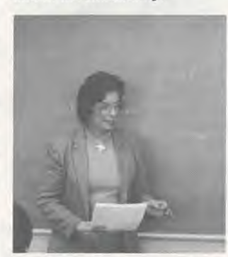
Modern classrooms—dedicated Christian teachers.

Education of the head and heart is supplemented by education of the hand as well as through industrial and vocational classes and through the varied work opportunities in the buildings and offices, in the industries, and on the farm, on the grounds, and in the community.