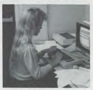
Our schools provide Quality Christian education using modern technology, equipment and instruction.

schools taught by 50 teachers. Sunnydale Academy opened with some 140 students bringing the total to 716 students in the Iowa-Missouri school system. In addition there are many students from the Conference in attendance at Andrews University, Loma Linda University and other Adventist schools. There is a great concern for the many young people who are not privileged to attend our Seventh-day Adventist schools. It is a goal of the Conference to make Christian education available to as many of the youth as possible.