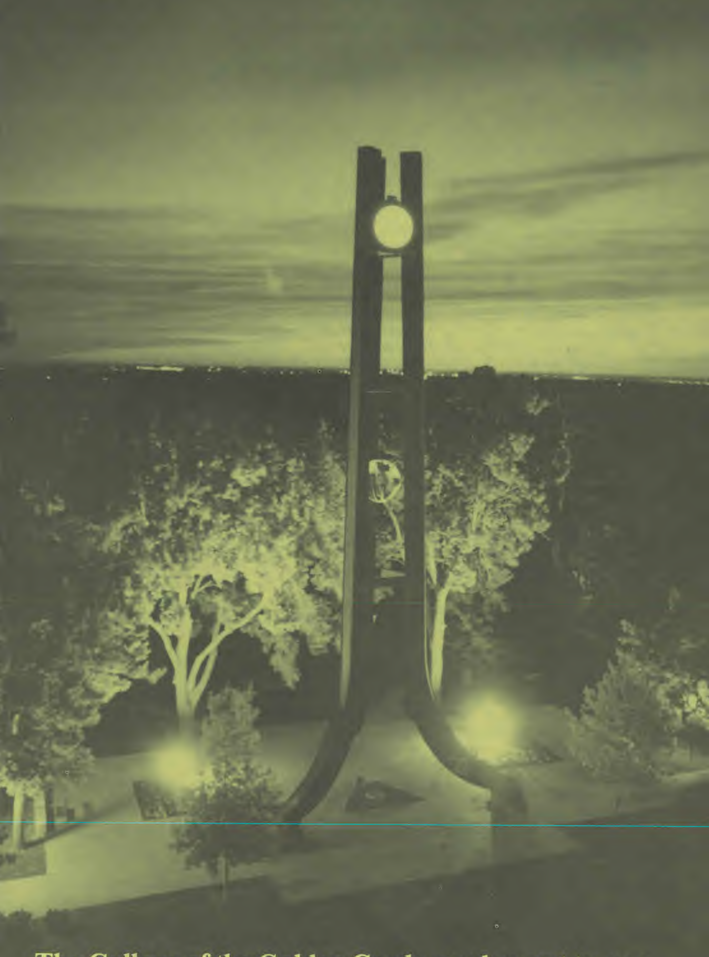
The College of the Golden Cords reaches out to you...