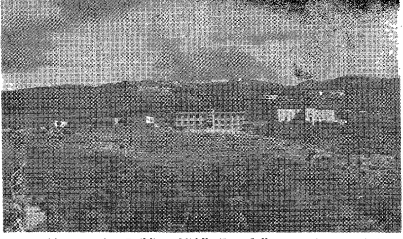
New Administration Building, Middle East College, nearing completion.

Let us all share in helping to bring in to the school more prospective workers, educate them with conscientious effort, and then send them forth under God into the ripening harvest.