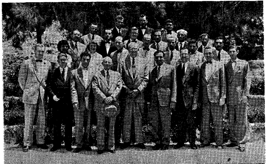
Publishing Convention delegates and office secretaries in attendance at the first Publishing Convention held in the Middle East, May 31 to June 5.

May it be true that the leaders, workers, members, and youth of the Middle East Division live up to and incorporate the motto of the convention into their actual everyday life-experience—"From Door to Door with the Master." Pray for the nearly one hundred regular and student colporteurs who will be in the field this summer. God grant that many honest and sincere individuals will be reached as we combine our efforts to quickly reach the millions in these lands. God hasten the day of our Master's return when we can meet and rejoice with those saved through gospel literature.