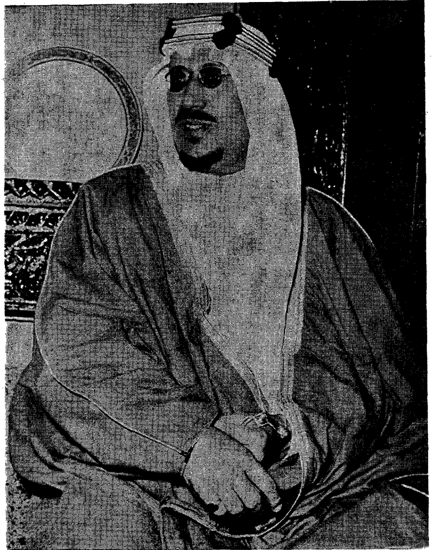
King Saoud Abdul Aziz of Saudi Arabia

Nile Union, has recently visited the Sudan and Aden. Many interesting contacts were made and the film, "One in 20,000" was shown several times. A group of government men in the Sudan were present at one showing, were very much impressed with the picture, and manifested a keen interest in the nature of the work we are doing.