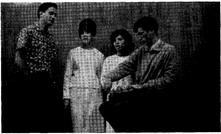
A mixed quartet is seen singing at a Saturday evening variety program at Middle East College, November 6. Special guests for the occasion were 18 students from the Lebanese Institute for the Blind, Baabda.