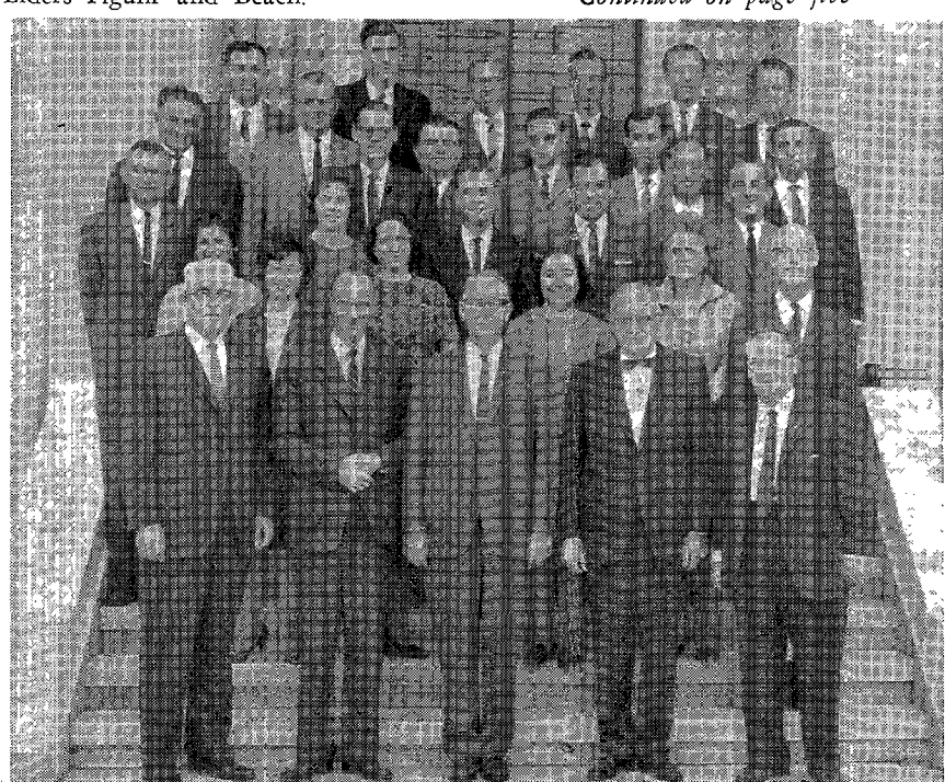
Members of the division committee pictured with other workers during the annual meeting, November 3 to 8.