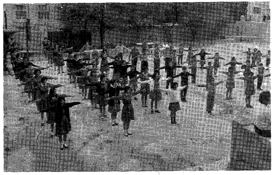
Students at the Amman school taking exercises to begin the school day.