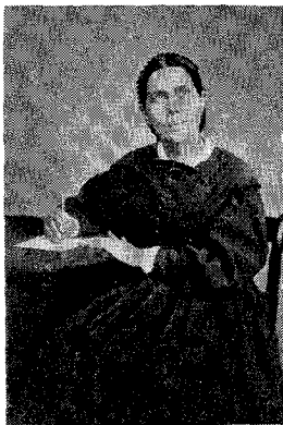
An early photograph of Ellen G. White, with her indefatigable pen, which has been used of God to guide, comfort, and admonish the advent movement.

REPEAL'S RECORD. —It is just five years since the repeal of prohibition [in the United States]. Granting that prohibition did not work too well, how has repeal worked? It has brought some public revenue in the form of liquor taxes—over a billion dollars last year—every dollar of which represents three or four dollars of private expenditure that is wasted or worse. It has driven two hundred thousand bootleggers out of business and has sent them into other forms of criminal and predatory enterprise, especially gambling and the peddling of narcotics. It has brought back the saloon, feminized and prettified, to be sure, with its face lifted and its nails manicured, with some (but not all) of its former corrupt alliance with politics eliminated, and with an entirely new entree to residential districts and to social circles which freely patronize under the name of "tavern" an institution they once scorned under the name of "saloon." It has turned every drugstore and grocery into a liquor store, and nearly every newspaper and magazine into an advertising medium for liquor.— Christian Century (Mod.), Dec. 14, 1938.