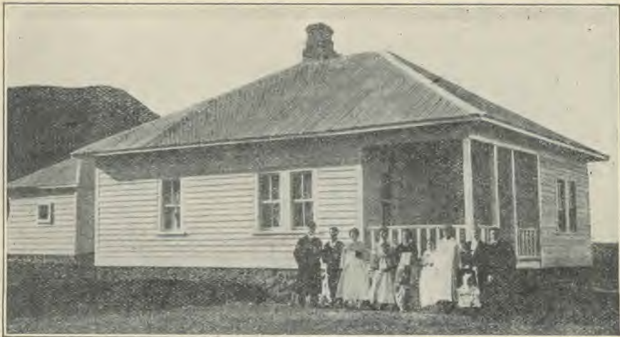
Mission Home in Korea. Built with money from $300,000 Fund. Cost, $715.