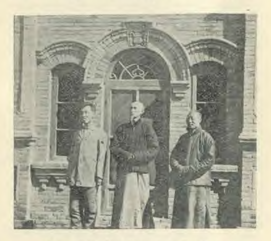
Three of the First Converts in Manchuria

presented. As we have been here only a few months, we can of course not say yet how our meetings will turn out, but some have al-