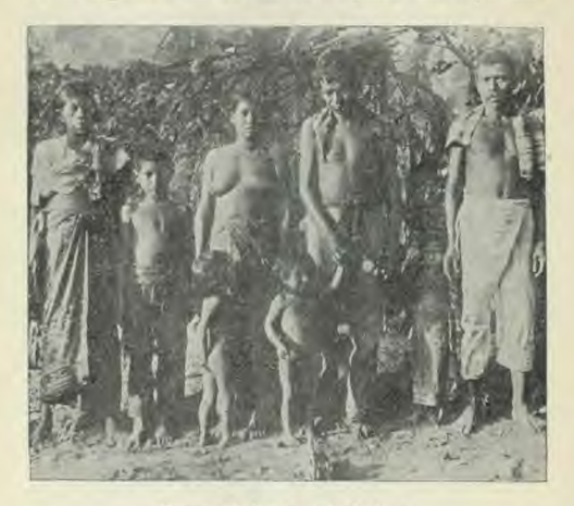
Group of Guatemala Indians

showing some of the members of one of the many tribes which make up the Indian population of Guatemala, amounting to more than one million, ninety-two per cent of whom cannot read, and few of whom can speak the Spanish