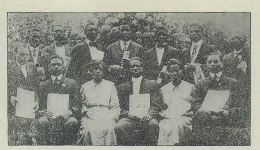
Modern History Class Oakwood Junior College