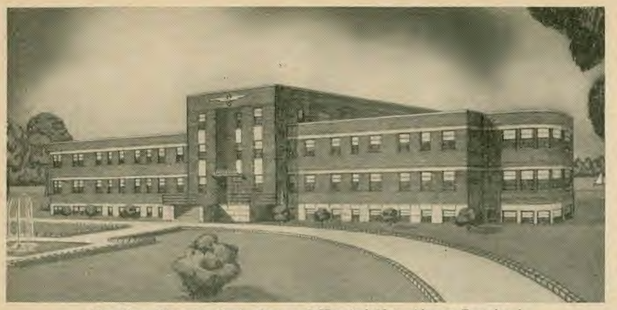
The New Riverside Sanitarium and Hospital Now Almost Completed