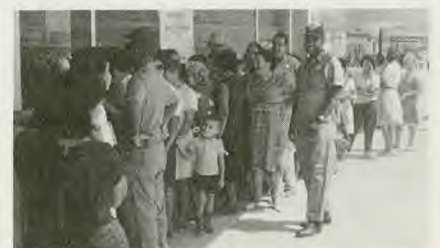
Hurricane victims lined up outside the Seventh-day Adventist welfare center in Raymondville, Texas, for distribution of food and clothing.