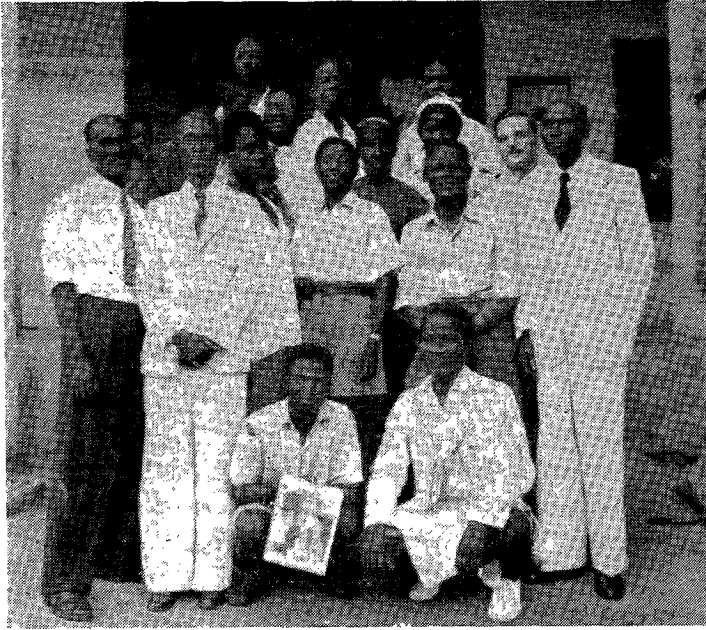
Members recently baptized in Accra, Gold Coast.

and the area which we would attempt to cover mapped out. Wa'ba is not a township and it was only by following the people to their farms that we could hope to get any audience.