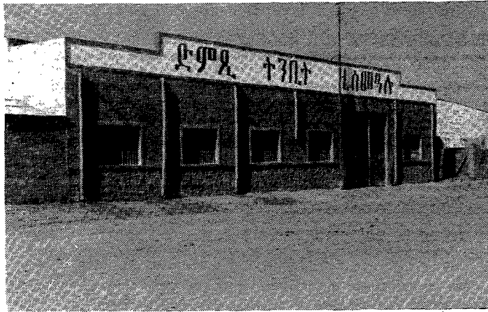
The Voice of Prophecy Auditorium with its name written above in Tigrinya.

Another person with whom I am studying, a member of the police force, has repeatedly expressed his happiness that the Bible has been made so easy to understand, after having sought someone to teach him the Bible for two years. At first we began