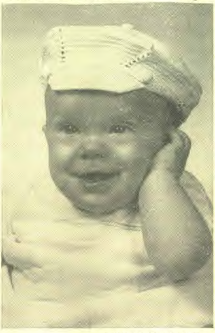
They will be talking about me in Parents' Exchange this year."