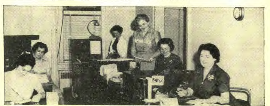
BIBLE SCHOOL - Part of the Bible School employees grading lessons.

Literature from Faith for Today went to Germany, Switzerland, England, Angola, Nigeria, Cameroon, Congo Republic, Ghana, The Union of South Africa, Jordan, Ethiopia, India, Australia, New Zealand, New Guinea, Malaya, Ceylon, Indonesia, Taiwan, Philippines, Mexico, British Honduras, Dominican Republic, Panama, Uruguay, Brazil, British West Indies, Bermuda, the Bahamas, Guam, and lonely Pitcairn Island.