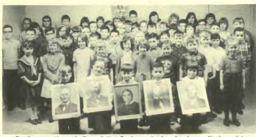
Grades one through five of the Spokane Junior Academy display pictures of our pioneers in the Advent message.

Noon Meal: Potluck (Bring Table Service)