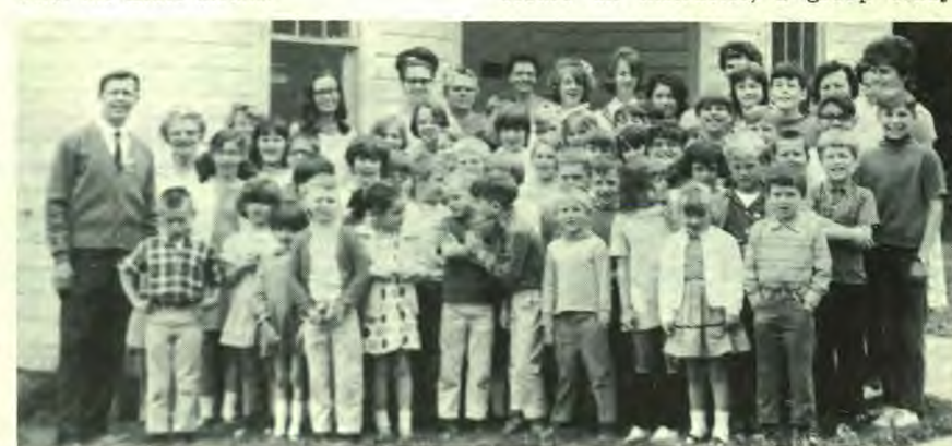
An average attendance of 45 included 27 non-Adventists at the Cedar Creek district Vacation Bible School.