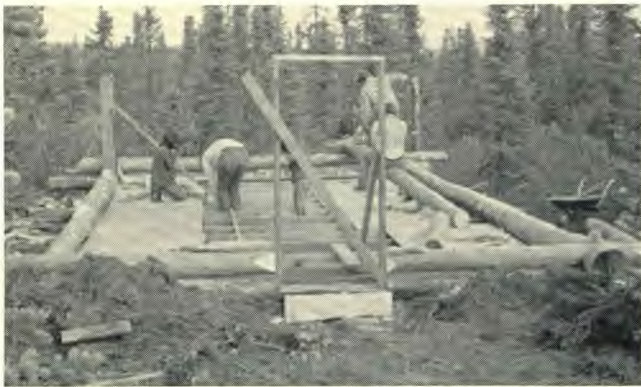
Second day of construction on the Ambler chapel.

The final phase of the project began after a group of interested people got together at the Southcentral Alaska Camp Meeting in August. Glenn Gingery, the Fairbanks