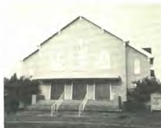
The third house of worship for the Salem congregation was built in 1937 at Summer and Hood, and called the Johnson Memorial church.