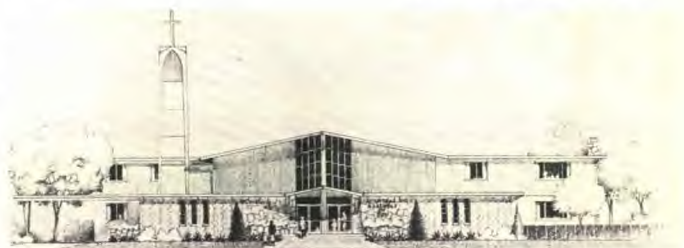
Across the street at 1330 Summer St., N.E., is the newest church for the Salem Central folk. It was acquired in the fall of 1976.