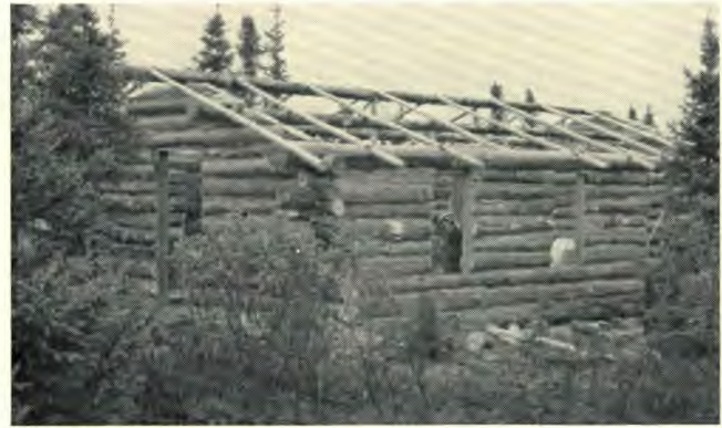
Fifth day of construction.