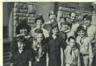
Some of the Payette-area Pathfinders who presented church programs.

● Payette Pathfinders had some happy surprises in their door-to-door Halloween