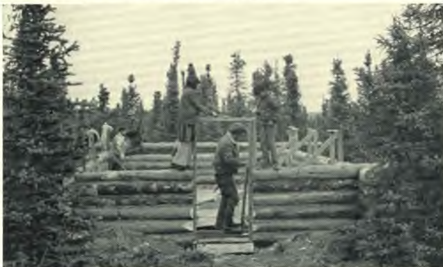
Third day of construction.