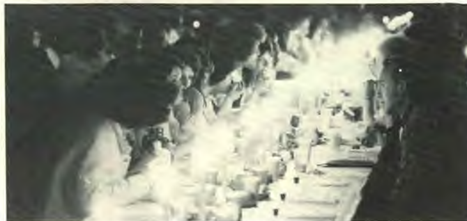
At the candlelight communion during the academy Bible conference at Gladstone, students were brought to a more meaningful significance of the Last Supper.