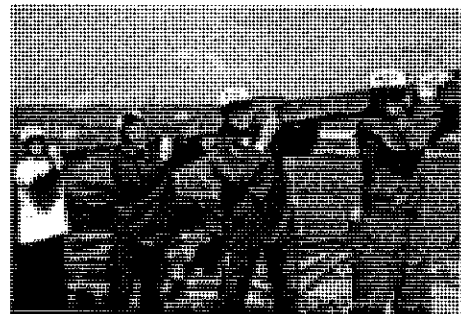
Volunteers of ADRA Japan in Mongolia