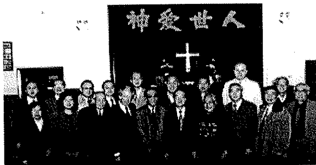
This is Gang Wa Shi Church for Korean and Chinese in Beijing: a church building for Sabbath and Sunday Keepers. There are about 800 Seventh-day Adventists who attend this church.

3. Church leaders have recognized the need to train more young people to take over the work from the older workers. Today many young people are receiving training in the 17 theological seminaries established by the Protestant Church leaders. In the East China Theological Seminary the visiting team met and talked to 9 SDA young people who are being trained to be pastors and Bible instructors.