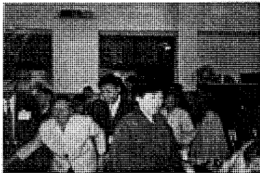
Visitors and ushers at the entrance door of the auditorium for the evangelistic meetings