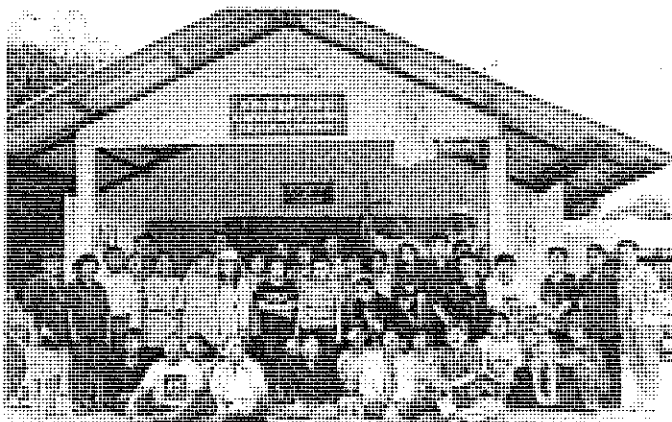
The church donated to the Thailand Mission by Japanese Adventists.

We made arrangements to hold a tent meeting for those who came to the free clinic. More than 300 people enthusiastically listened to the gospel. I was compelled to speak without referring to my notes, and use gestures, instead. On the Sabbath the chapel was crowded. We had