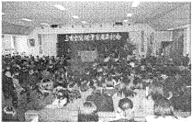
100th Anniversary of San-iku Gakuin College in Japan.