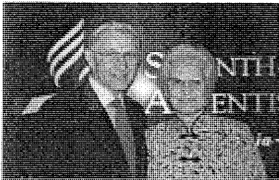
Elder & Mrs.