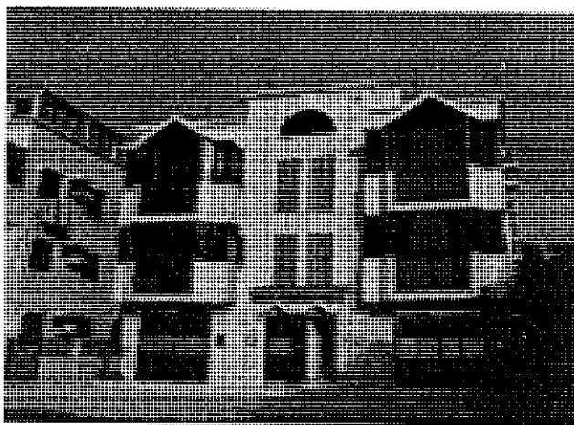
The headquarters of the East Asia Association in Hong Kong

There were four options in terms of reorganization. (1) Uniting SCIUM and EAA. But, Taiwan and Mongolia become attached organizations to the NSD. (2) Uniting SCIUM and EAA. But, Mongolia becomes an attached organization to the NSD. (3) Uniting SCIUM and EAA. But, Taiwan Mission, Hong-Macao Conference and Mongolia become attached organizations to the NSD. (4) SCIUM and EAA maintain their present structures. Later the option (2) was recommended.