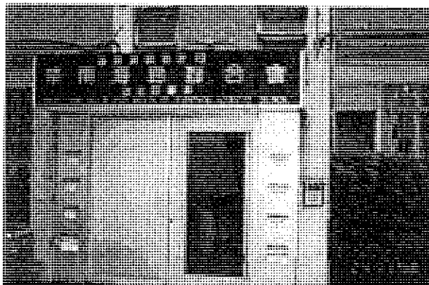
The Taiwan branch office of the South China Island Union Mission headquarters in Taipei

It was voted that the NSD Administrative Committee act as the new Chinese Union Organization Management Committee until all details have been decided.