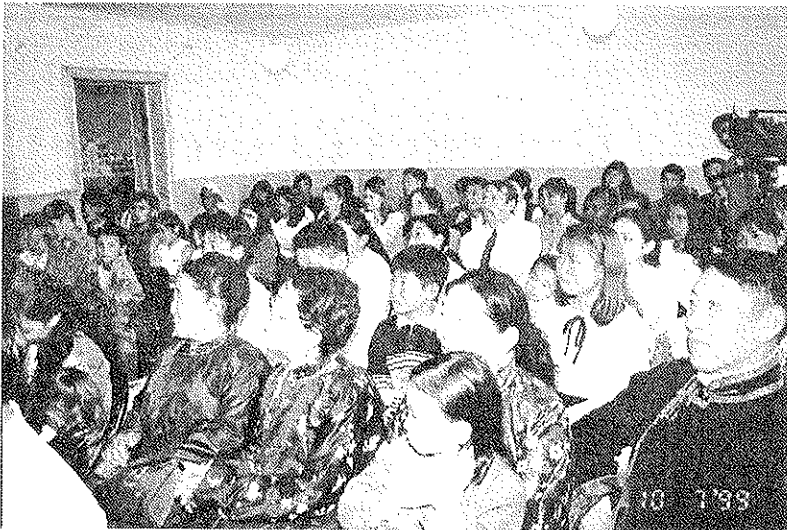
The congregation during the church service on July 10, 1999 in Mongolia.