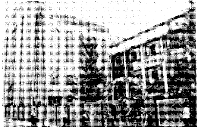
Language Institute Headquarters in Seoul, Korea