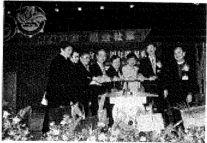
At the "Lit the Light" Ceremony

Nowadays, there are more than forty organizations including schools, hospitals, churches, social service centers, book store and food agents established in the territory to help spread the Gospel.