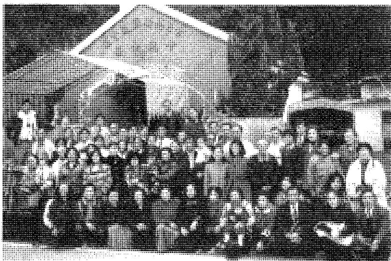
The attendants at the Kao Chung Church on Dec. 18, 1999

I began the revival meetings on December 17 (Friday) - 18 (Sabbath) at the Kao Chung Church after driving for two and half hours from Kao Hsiung City. I preached three times under the theme, "Experience the Certainty of His Coming." This was a combined meeting of four churches composed of the Bunun tribe. The special vocal music appealed me very much and reminded me of a Mongolian melody. They sang powerfully in voice and spirit.