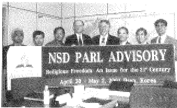
The Participants of the PARL Advisory