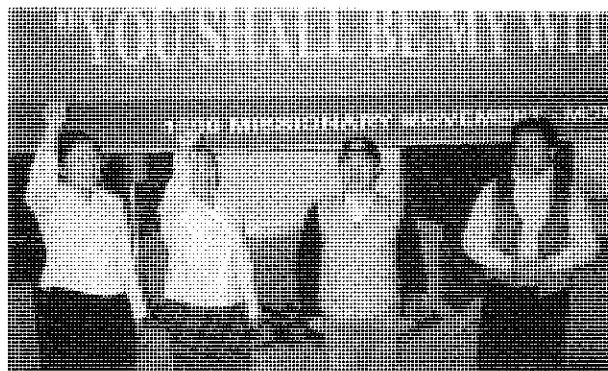
Four of 21 young Mongolians trained for 5 weeks.

unorganized churches, and 10 meeting places with a total membership of 262. It is remarkable to note that 9 out of the 13 places where the Seventh-day Adventist people meet on Sabbath were started by 21 volunteer missionaries from Korea, the Philippines and North America, serving through the 1000 Missionary Movement. It may be a providential coincidence that this year 21 Mongolian people have joined the 1000 Missionary Movement in Mongolia. Twenty-one missionaries served in Mongolia, and now 21 national missionaries will follow in their footsteps.