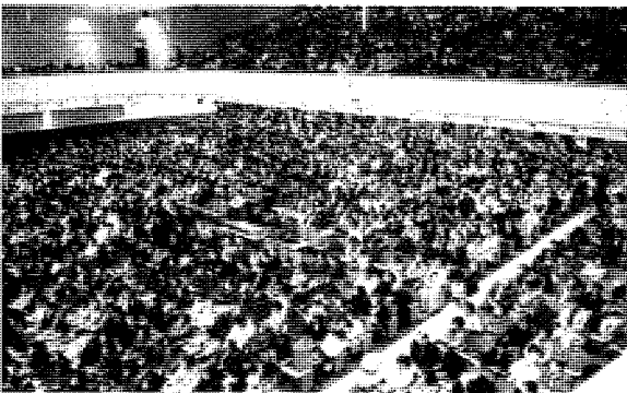
The Attendance of the Church Service on November 9, 2002 at Sahmyook University Auditorium with around 3,000 people.

5. To hold a Division-wide Stewardship Summit in conjunction with the NSD Midyear Committee in 2003. The dates is May 9-13 in Korea. Attendance will be Division/Union Officers, Conference/Mission Presidents and Mongolia Mission Field Director. Division/Union/Conference Stewardship Directors, University/College