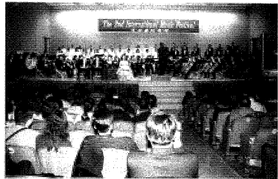
The 2nd International Music Festival was conducted at 7 p.m. on November 9, 2002 at the Sahmyook University Auditorium.