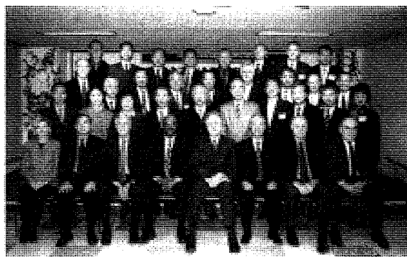
The Attendance of the 2002 NSD Annual Council, November 7-11, 2002.

1. Our Division church membership has reached 504,020 as of September this year. The ratio of members to population within division territories is 1: 3,049 as compared to 2001 Annual Council 1: 3,111. The world church membership is 12,743,508. This is 1 SDA for every 491 people living on our planet. Our challenge is so great. Growth rate continues to decline. In 2001, the growth rate is 3.3 percent compared to 4.9 percent in 2000. Which means that SDA membership increased an average of 57 per day, as compared to 74 per day in 2000.