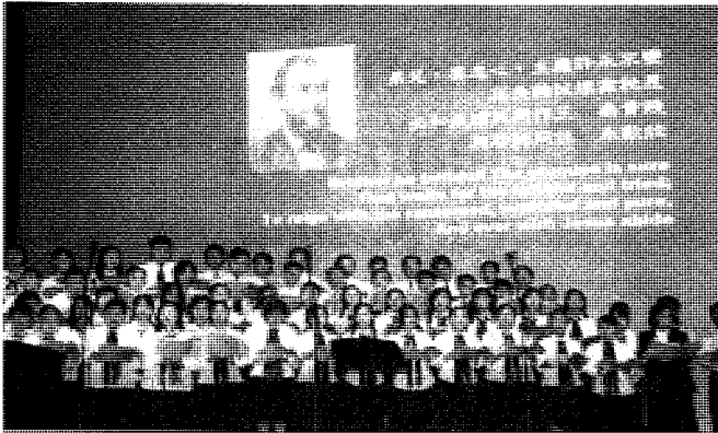
The United Choir in Hong Kong before the Sermon