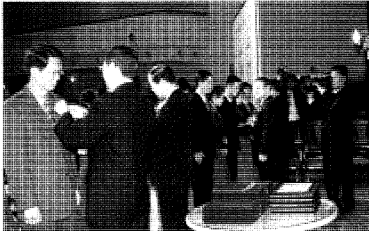
The five Missionaries received the first badges of the Pioneer Mission Movement by their sending organization leaders.