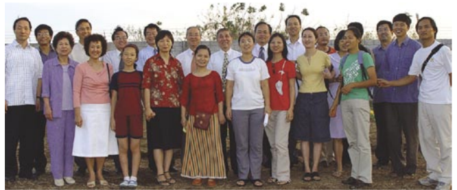
Chinese students attending AIIAS celebrate the groundbreaking for 8 new student apartments.

AIIAS G round was broken at five o'clock p.m., March 4,