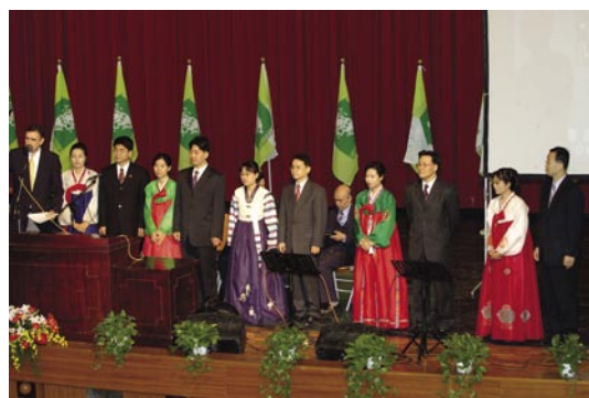
Recognition given to the PMM Pastors