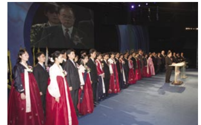
Third Group Pioneer Mission Movement dedication

The final program of the celebration, was a dedication ceremony for 15 Korean families of the Pioneer Mission Movement (PMM). They dedicated their lives to planting churches for next 6 years in other countries, including Japan, Taiwan, Mongolia and others. Since 2003, the Northern Asia-Pacific Division has sent 15 PMM missionaries to Japan and Taiwan.