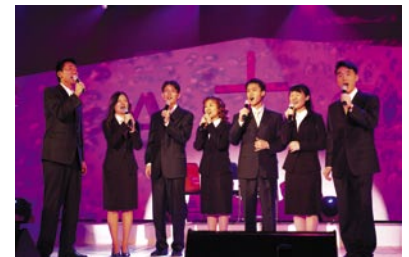
First Group of Golden Angels