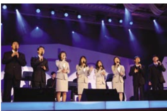
Second Group of Golden Angels