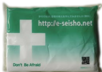
Bible Study Invitation on Pocket Tissues.

The plastic covers of tissues advertise the website, http://e-seisho.net for internet Bible studies. Also, seals can be placed on the cover to advertise evangelistic seminars and Christmas events.