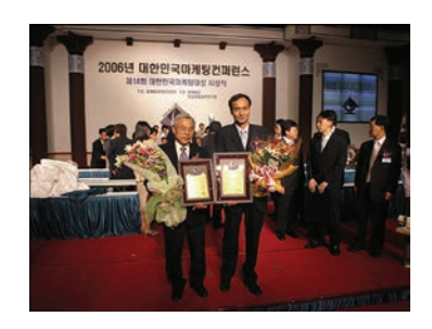
Accolades Page 2