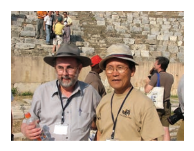
Bible Conference Page 3