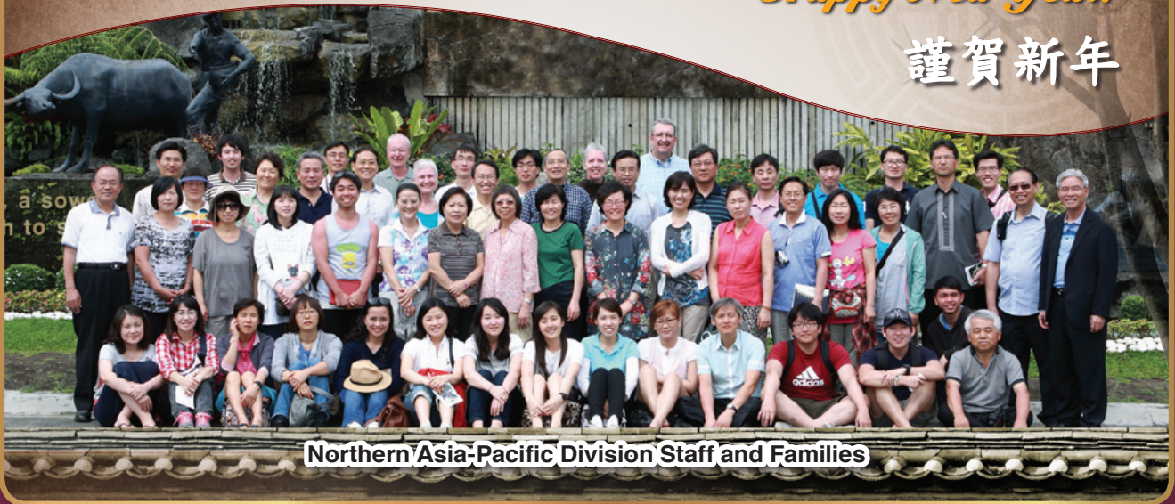
Northern Asia-Pacific Division Staff and Families