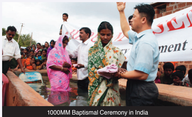
1000MM Baptismal Ceremony in India