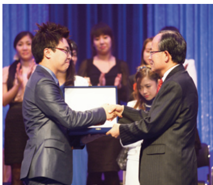
NSD President gives Appreciation Plaque to GA Member