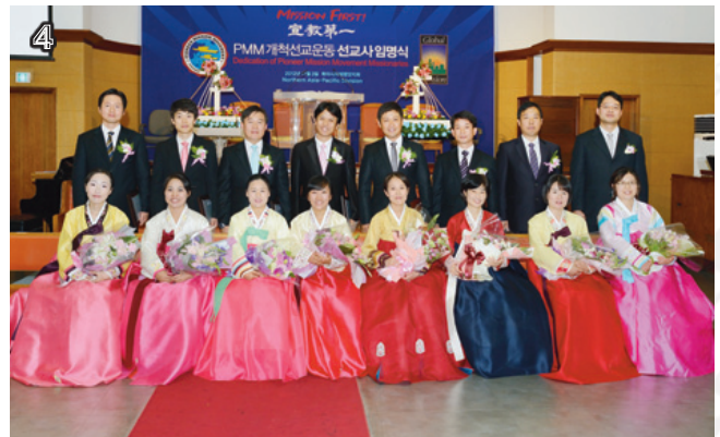
1. 11th Batch PMM Missionaries during the Ceremony 3. GC & NSD Leaders pray for the Missionary couples