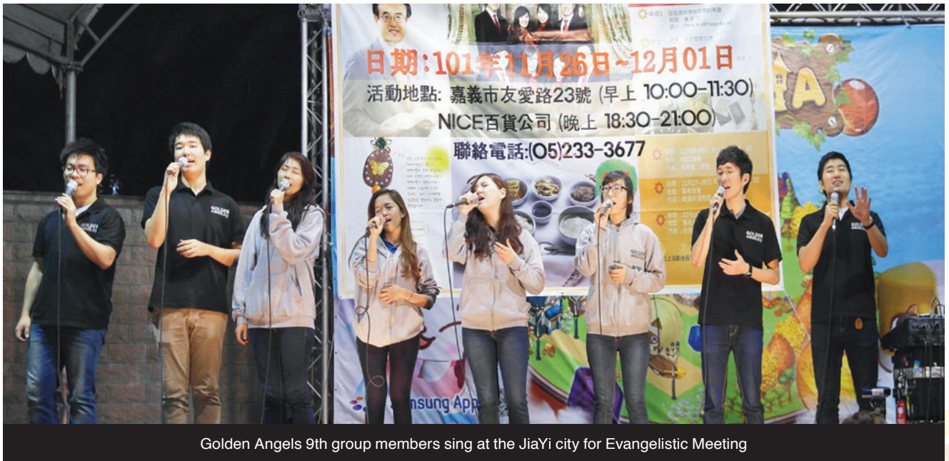
Golden Angels 9th group members sing at the JiaYi city for Evangelistic Meeting

The beginning of the end has come. The singing missionaries of the Northern Asia-Pacific Division (NSD), Golden Angels 9, had a great opportunity to spread the gospel in Taiwan. November 11, 2012, they departed from Korea traveling to Taiwan for their very last mission trip. Though they are in their very last mission trip, they started their special mission with the conviction that, “If God is with us, who can be against us?” God’s army is now ready for the battle!