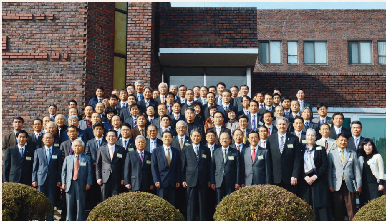
2012 Korean Union Conference Annual Council Participants

The KUC will follow the Great Controversy Project consistently by producing three million abridged editions, and fifty thousand complete editions.