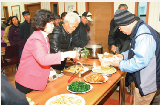
Love Church provides foods for Homeless people