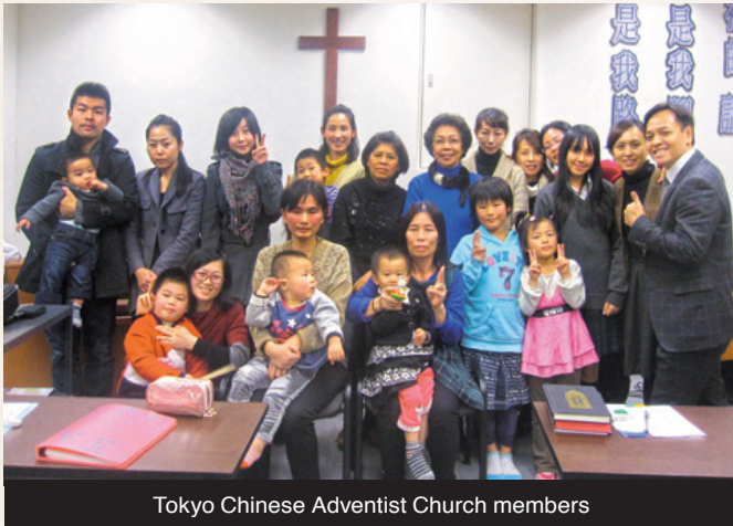
Tokyo Chinese Adventist Church members