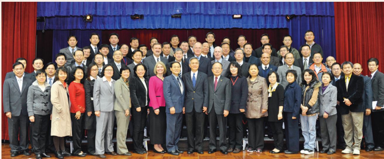
2012 Chinese Union Mission Special Session Participants