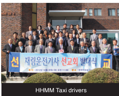
HHMM Taxi drivers