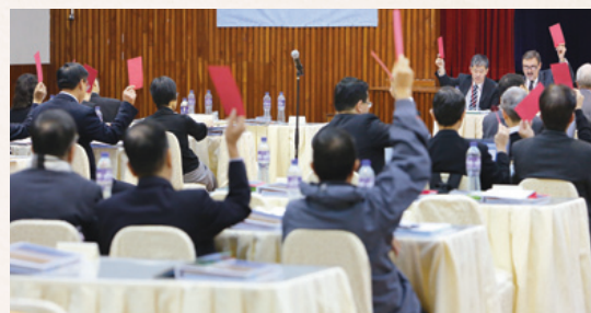
Participants vote during the Session