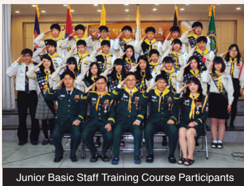
Junior Basic Staff Training Course Participants

The JBSTC is the Korean version of Teen Leadership Training (TLT) which was created by the General Conference (GC) for teenagers. The JBSTC has changed