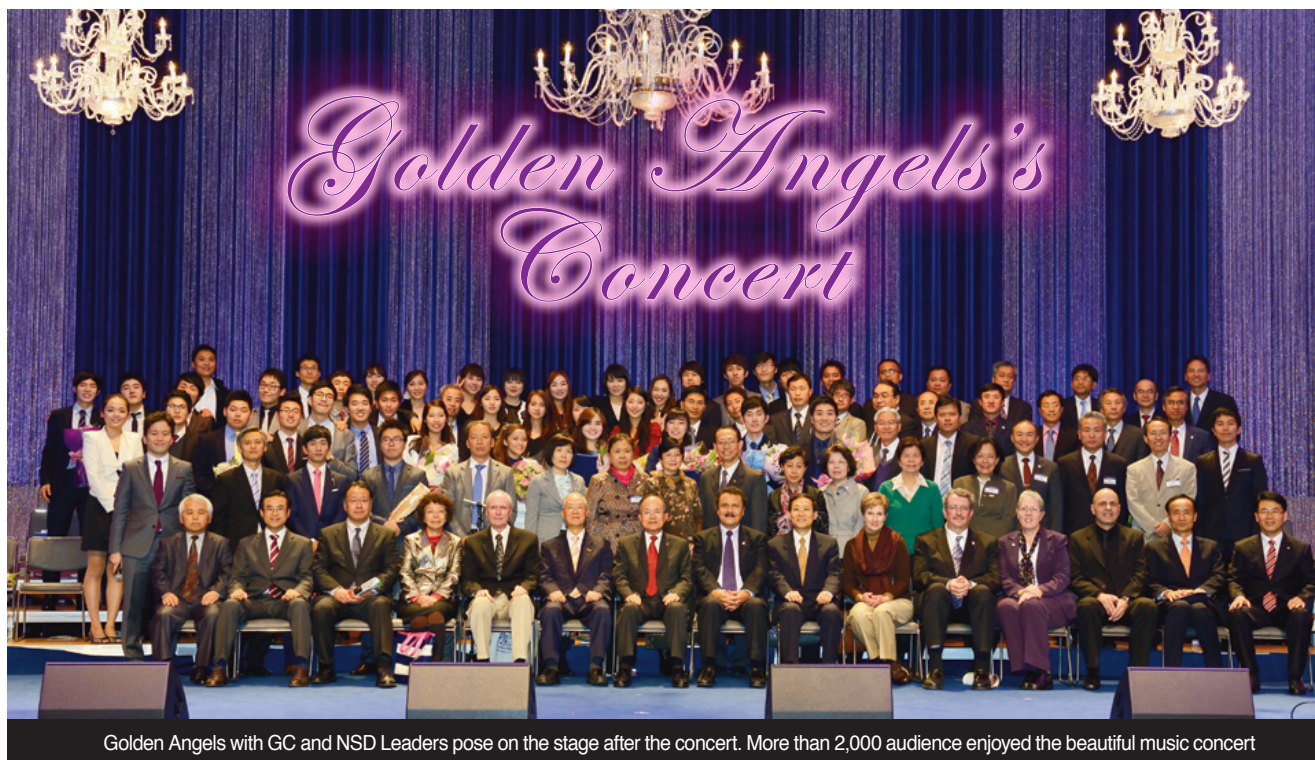
Golden Angels with GC and NSD Leaders pose on the stage after the concert. More than 2,000 audience enjoyed the beautiful music concert

On November 4, 2012, the Golden Angels, a group of singing missionaries from the Northern Asia-Pacific Division (NSD), held a mission concert at Sahmyook University, Korea. There were more than 2,000 people in attendance at the concert.