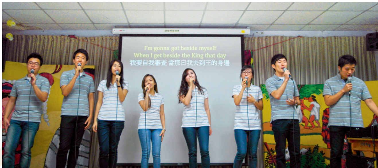
Golden Angels 9th group members sing during the local church crusade in Taiwan

seven precious souls willingly offered their entire lives unto the Lord on the Sabbath Day.