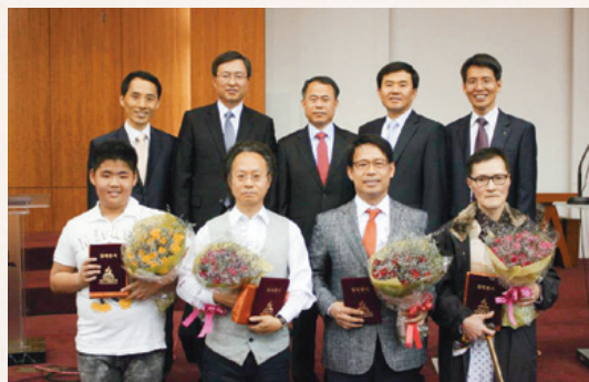
Church pastors pose with Newly baptized members

The last Sabbath of the Festival, Golden Angels 9 gave a special concert for the people. During Sabbath