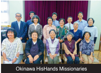
Okinawa HisHands Missionaries