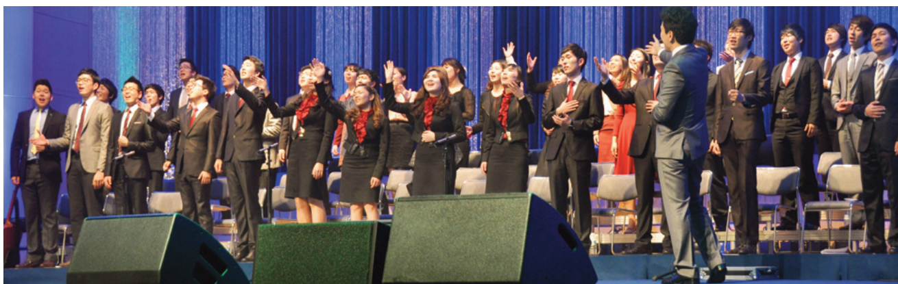
Golden Angels with their OB members praise God with a beautiful voice