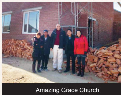
Amazing Grace Church

On October 13, 2012, the MMF officers conducted an inauguration ceremony, and organization of the Munkhiin Geree SDA Church located in the Ovorkhangai Province.