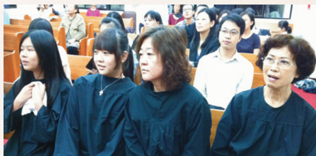
Four Newly baptized Members

member or a friend. While we struggle with the attacks of Satan on our homes, we can surely trust that if we believe in Him, God will lead us to the ideal home of all homes—the new heaven and new earth. These topics were well received as the approach to evangelism was new to them.