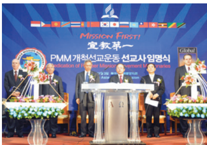
GC & NSD Leaders