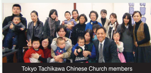
Tokyo Tachikawa Chinese Church members