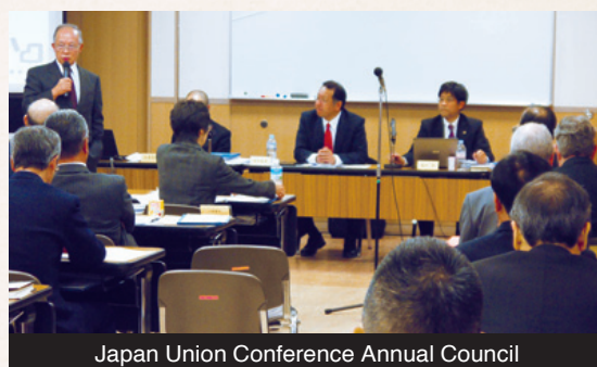
Japan Union Conference Annual Council