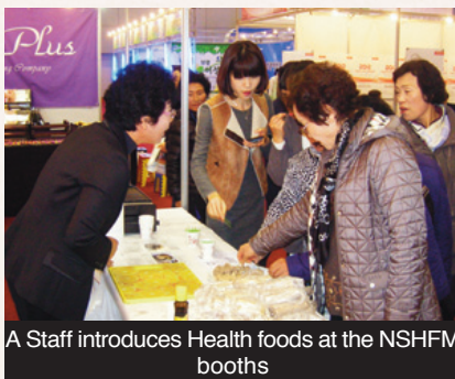
A Staff introduces Health foods at the NSHFM booths