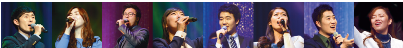
Members of Golden Angels 9