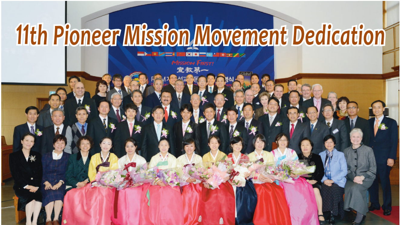
Pioneer Mission Movement 11th batch missionaries with NSD Annual Council delegates

On November 3, the Northern Asia-Pacific Division (NSD) held a dispatching and dedication service for the Pioneer Mission Movements (PMM) 11th batch of missionaries at the Seoul Central Church.