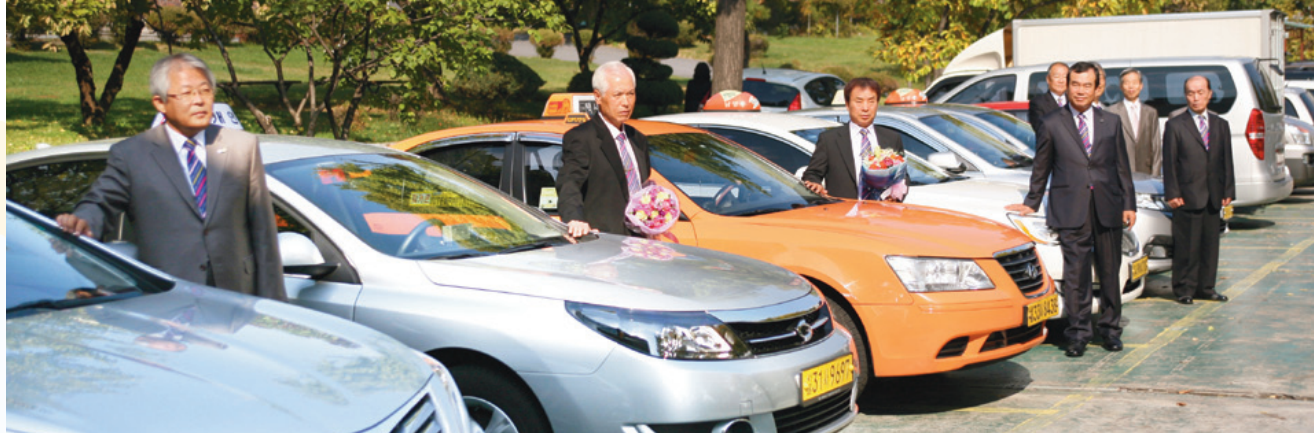
Nine Taxi drivers newly joined the HisHands Mission Movement as Missionaries

On Tuesday, October 30, 2012, there was a His Hands Missionary Movement (HHMM) missionary dedication ceremony in the auditorium of the Korean Union Conference (KUC). The missionaries who applied for HHMM at this time were all taxi drivers who have passion for Christ.