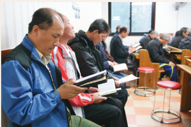
New Members attend the Church worship through Homeless project