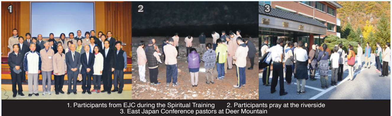
1. Participants from EJC during the Spiritual Training 2. Participants pray at the riverside 3. East Japan Conference pastors at Deer Mountain

I had attended a revival program in Korea from October 21 through 29, 2012. While there, each of the participants were given plenty of time in the mornings and in the afternoons to pray quietly, to read the Bible and the Spirit of Prophecy books, then meditate.