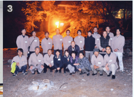
3. Group picture of EJC participants

Through this program, the Holy Spirit has taught me how great the love and the grace of God is, and how the cross of Jesus is trying to lead me to the hope of salvation.