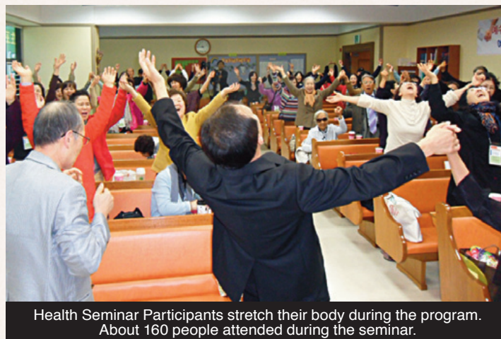
Health Seminar Participants stretch their body during the program. About 160 people attended during the seminar.