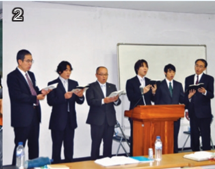
2. EJC Pastors sing Special Music