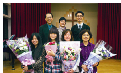
Newly baptized members of Xintien Church, Taiwan