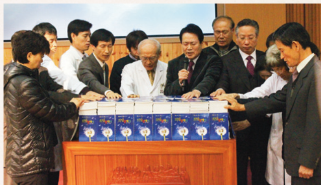
Eden Hospital staff put their hands on the Great Controversy books for prayer

After worship, the participants went door-to-door to distribute booklets. They worked together to send 1,200 of the booklets, ‘Relay of Hope’, by mail. ‘Relay of Hope’ is the abridged version of ‘The Great Controversy.’ They then went by twos and threes, handing out ‘Relay of Hope’ to people in the community. They visited stores, institutions, and even a remote mountain village. The total number of people the books were distributed to was 5,400. Up to this point, they