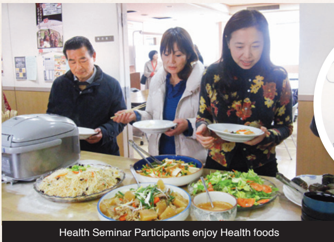
Health Seminar Participants enjoy Health foods