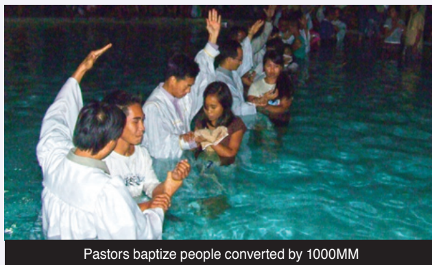
Pastors baptize people converted by 1000MM

Missionaries: Korean churches and brethren can write encouraging letters to our missionaries.