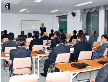
1. Spiritual Training of Japanese Pastors