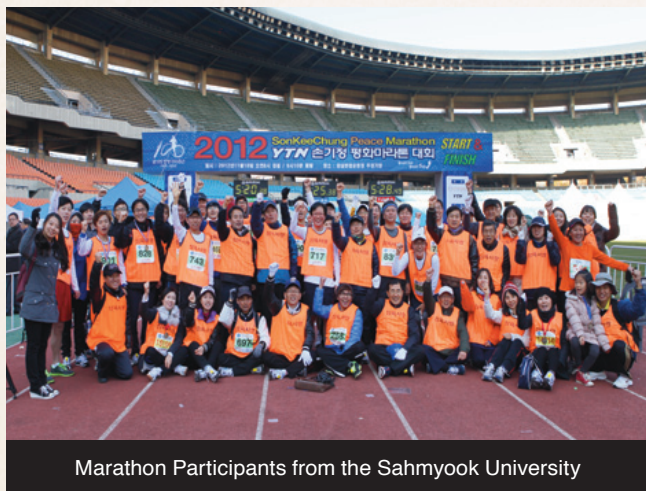
Marathon Participants from the Sahmyook University