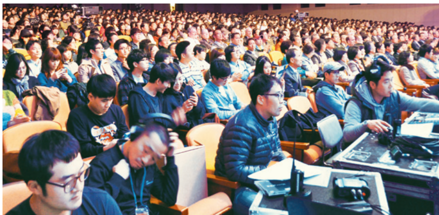
More than 2000 audience enjoyed the concert