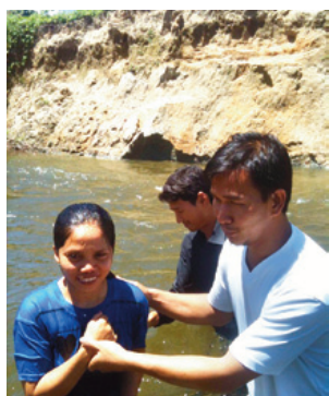
A newly baptized member by the efforts of the Indonesian 1000MM