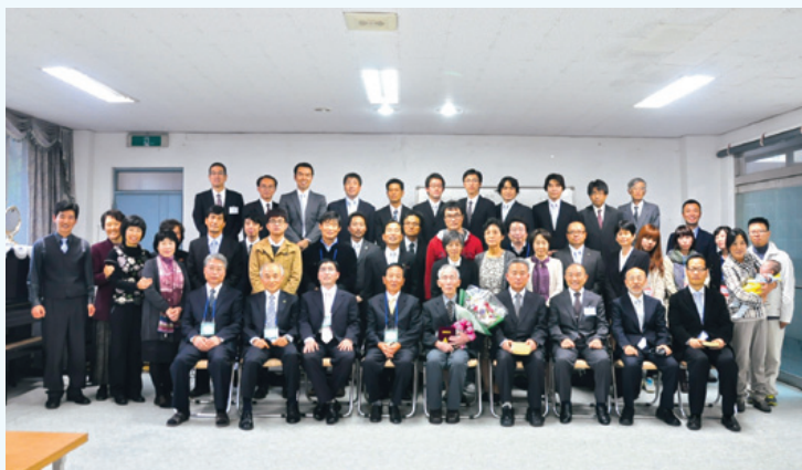
East Japan Conference pastors during the Spiritual Training in Korea

We spent from Monday morning until noon on Friday in silence, though some participants could not keep