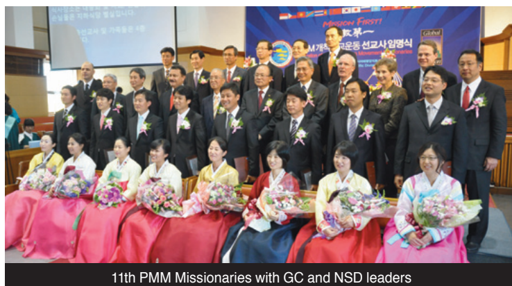
11th PMM Missionaries with GC and NSD leaders