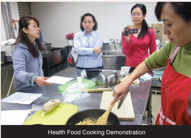
Health Food Cooking Demonstration

A Health Evangelism Seminar was held on November 22-24, 2012. This seminar was a follow-up to the health seminar held at the Japan-Chinese Church in Tachikawa on April 14, 2012. The theme was “Health: the Never Ending Subject.” Each day started with a cooking demonstration followed by two lectures in the church. After lunch came practical classes such as hydrotherapy, use of charcoal, and home remedies for burns, scalds, coughs and soft tissue injury.