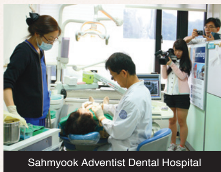
Sahmyook Adventist Dental Hospital