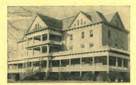
Iowa Sanitarium and Hospital "The Health Center"