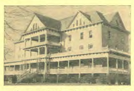
Iowa Sanitarium and Hospital "The Health Center"

Pray for these dear people and include all those who listen in. Urge your friends to tune in to the Radio Bible School every Sunday morning at 9:15. Station WHO (1000 kilocycles) Des Moines.