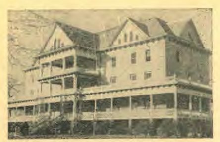
Iowa Sanitarium and Hospital "The Health Center"