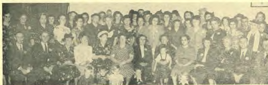
Southeastern Federation Group

It seems that people, like things, have the faculty of getting lost. We have listed below the names of persons on our Conference Church membership list for whom we have no address. We wish to solicit the assistance of anyone in the Northern Union Conference who might know the whereabouts of any of these people. If you know the address of any of them will you please put their name with their address, on a post card and mail it