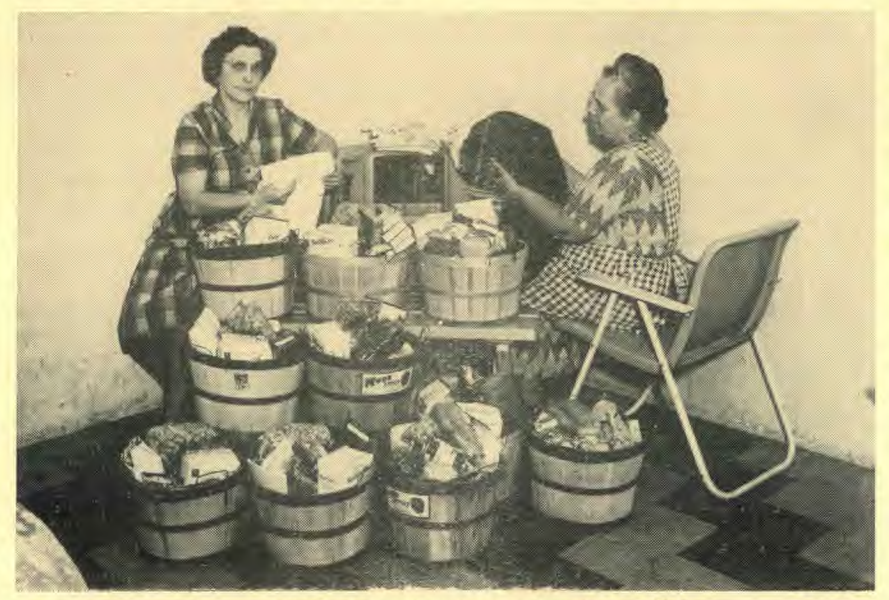
DORCAS WORKERS AT GRANITE FALLS