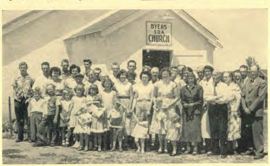
"SIGNS" SUBSCRIPTION RAISES NEW CHURCH